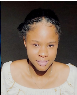
Mission Sales Agnes Scott (Tennis Scholarship)