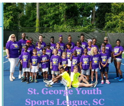
St. George Youth Sports League, SC

A NEW USTA SOUTHERN NJTL CAPACITY BUILDING GRANT OPPORTUNITY!