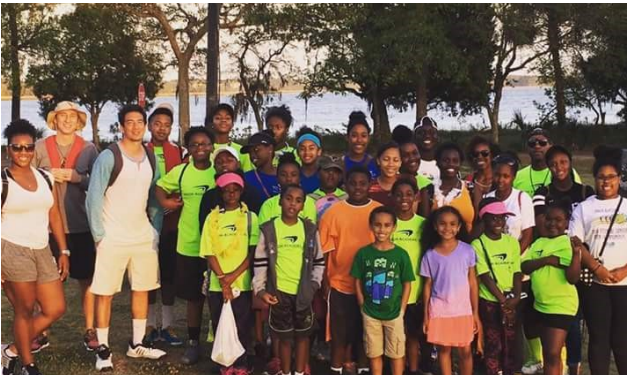
GA's MACH Academy NJTL at the Volvo Car Open in Charleston, SC in April