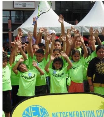
GA's Agape NJTL at the BB&T Atlanta Open