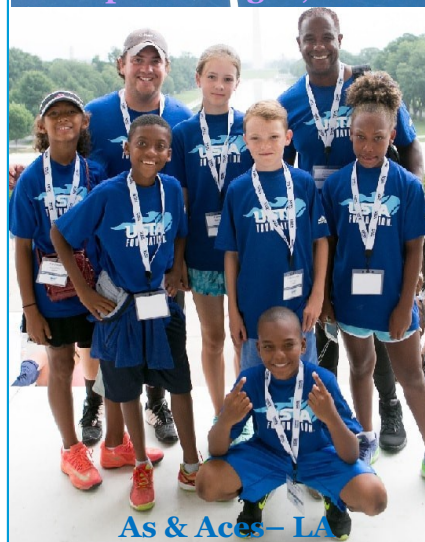
As & Aces - LA