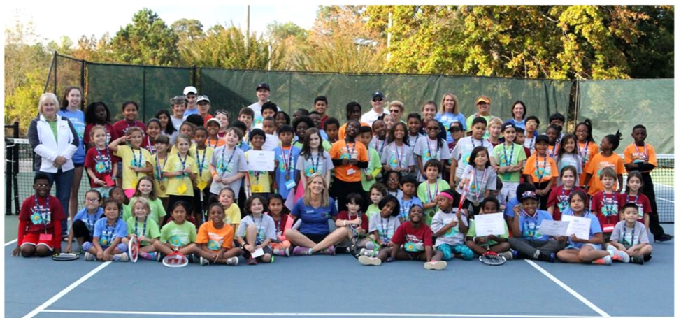
SANDY SPRINGS TENNIS ASSOCIATION- KIDS-LUV-TENNIS, GA