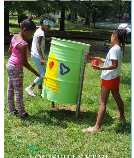
LOUISVILLE STAR HITTERS NJTL, KY