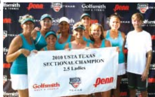
2.5 Women's team from High Point