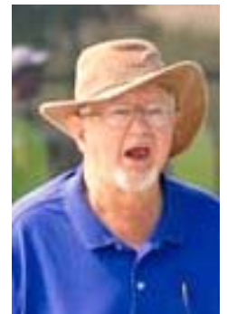
Big Bob at it again!