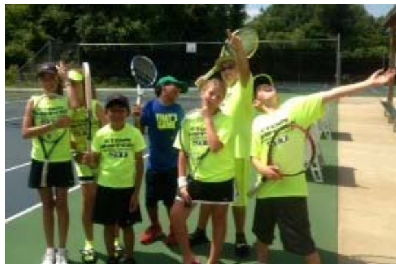
WHIPPERS whooping it up!