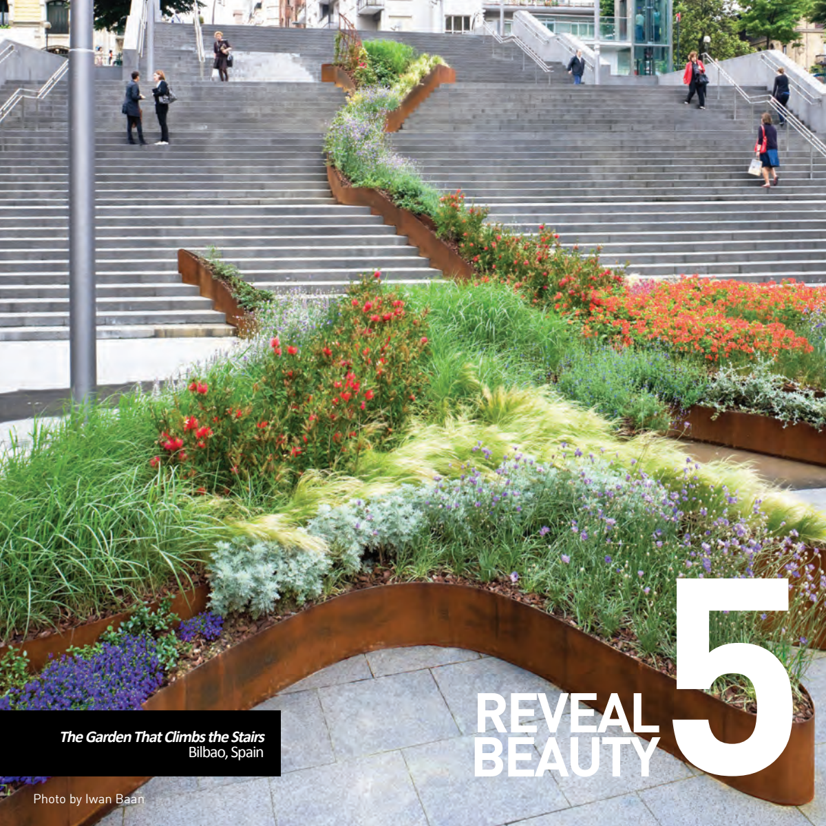
The Garden That Climbs the Stairs Bilbao, Spain