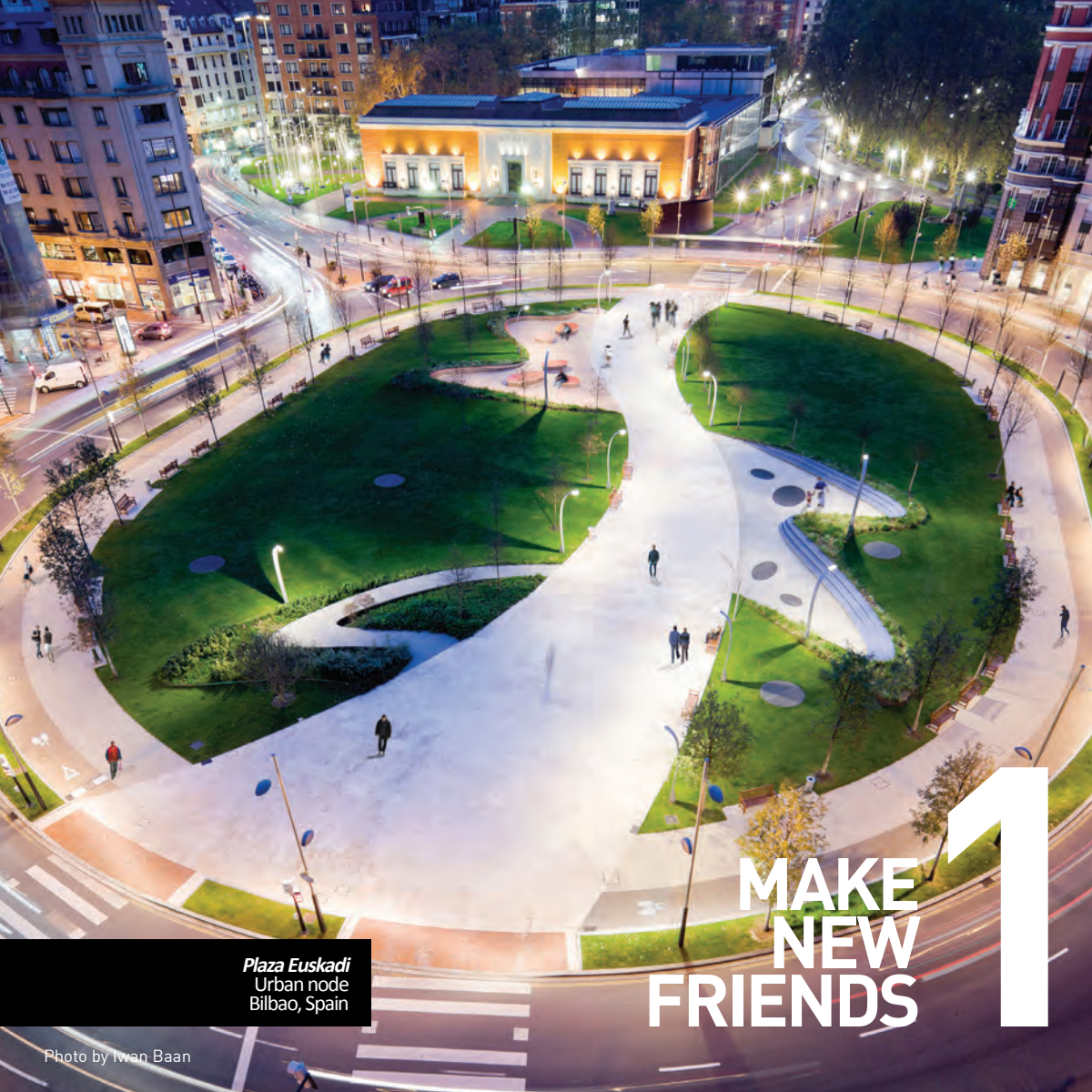
Plaza Euskadi Urban node Bilbao, Spain