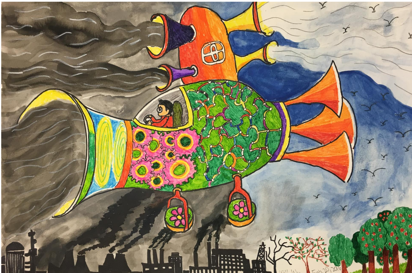
Clean Air for Everyone! by Will (age 9)

This majestic vehicle soars over the sky searching for greenhouse gases or unclean air. It sucks in the unclean air and purifies it through a series of pipes. After all of that, clean air will come out of the big openings and there will be crisp, fresh and clean air for everyone!