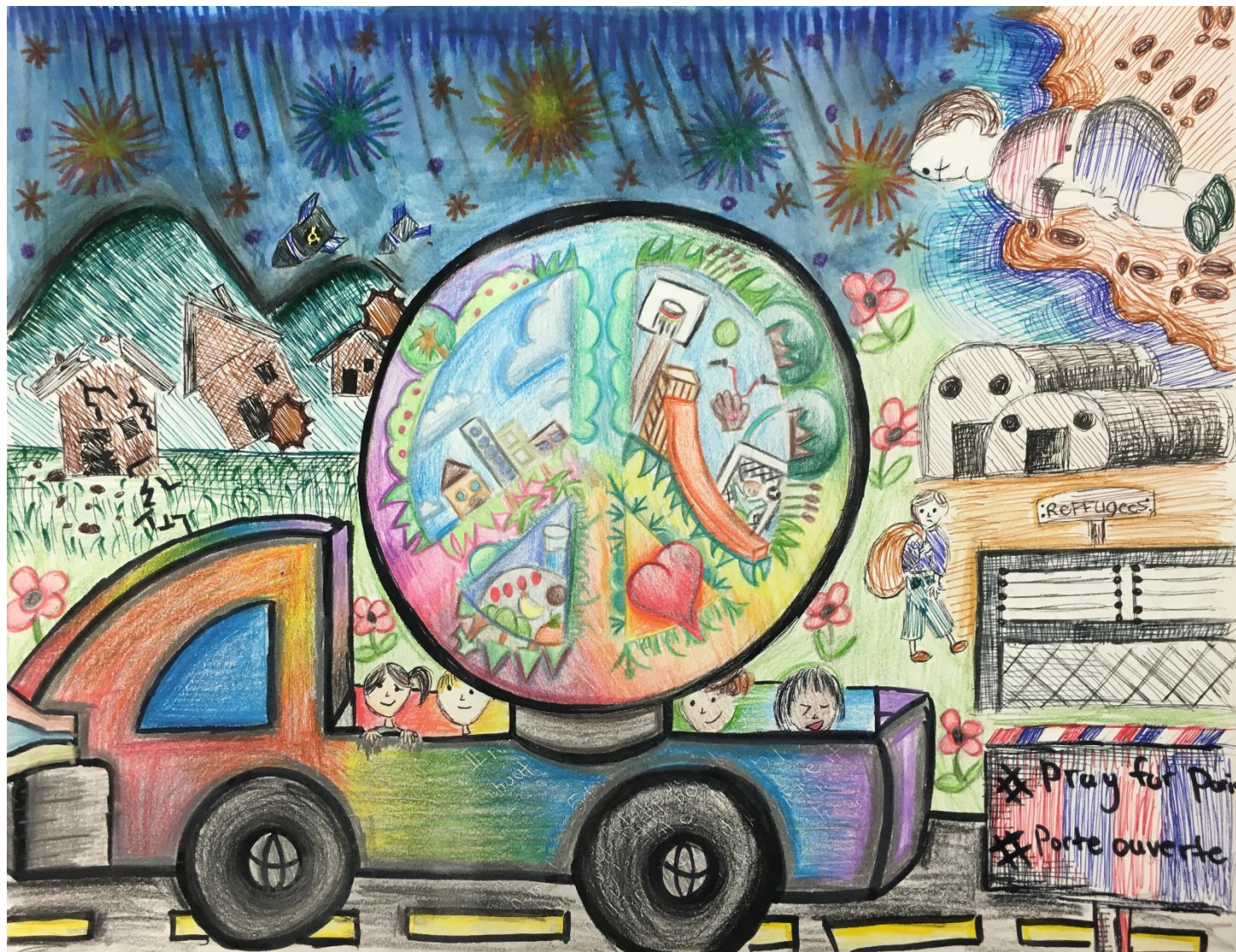
The Universal Aid Car by Aileen (age 11)

In the world there are about 59.5 million refugees, homeless, helpless and hurting, to add to that number we have others - orphans, slaves and mistreated people. They need aid and food and so much more! My Universal Aid Car would help the refugees, and others and give them a place to live. I think we should step up and help someone - after all, we live in the same world under the same stars.