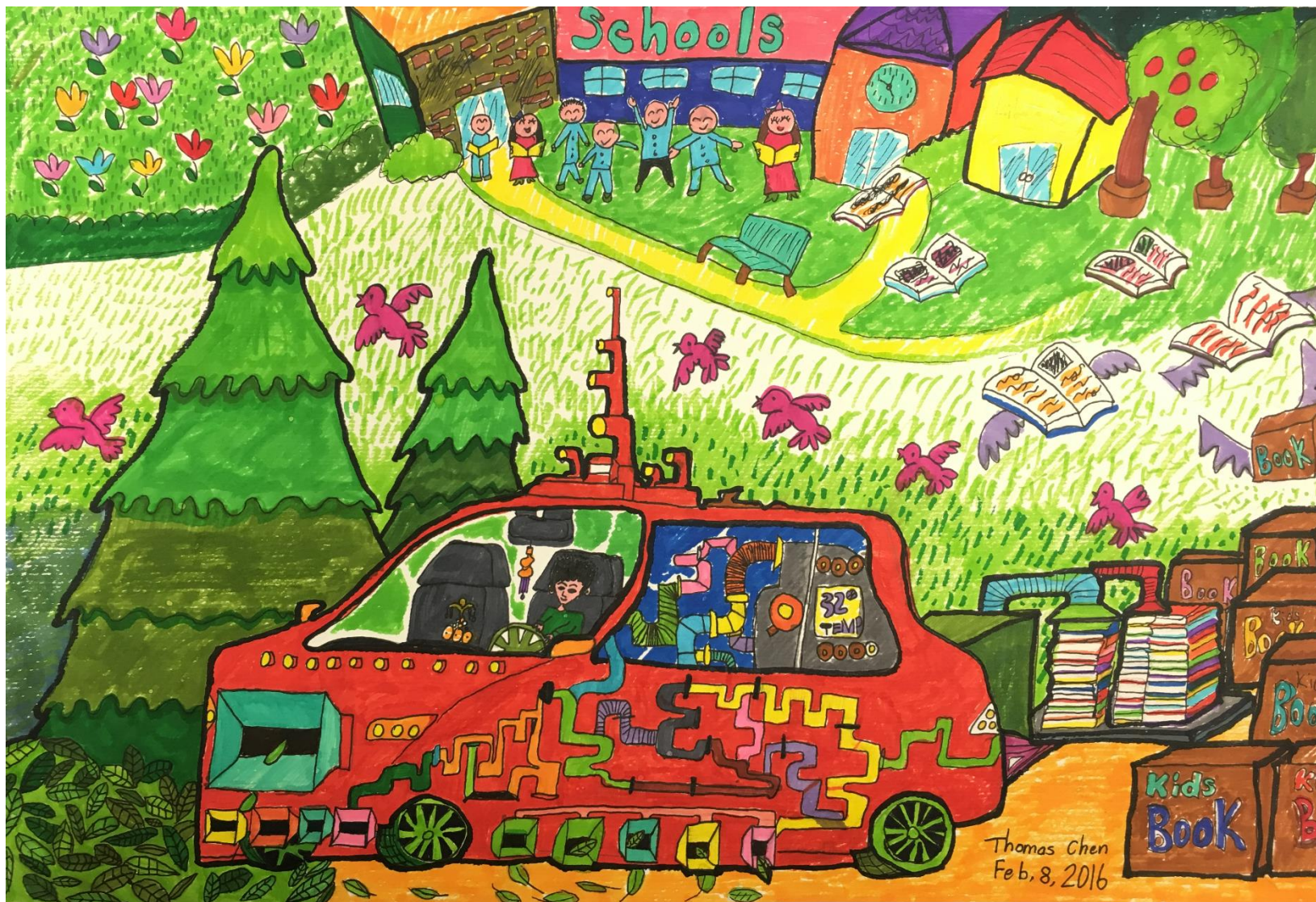
The Book Creator Car by Thomas (age 7)

In the future, when people drive car on the street, the vehicle will collect leaves from trees at the same time. Leaves will be processed under a special program in the vehicle and turned out to be different categories of books. Those books will be delivered to schools libraries for kids to read.