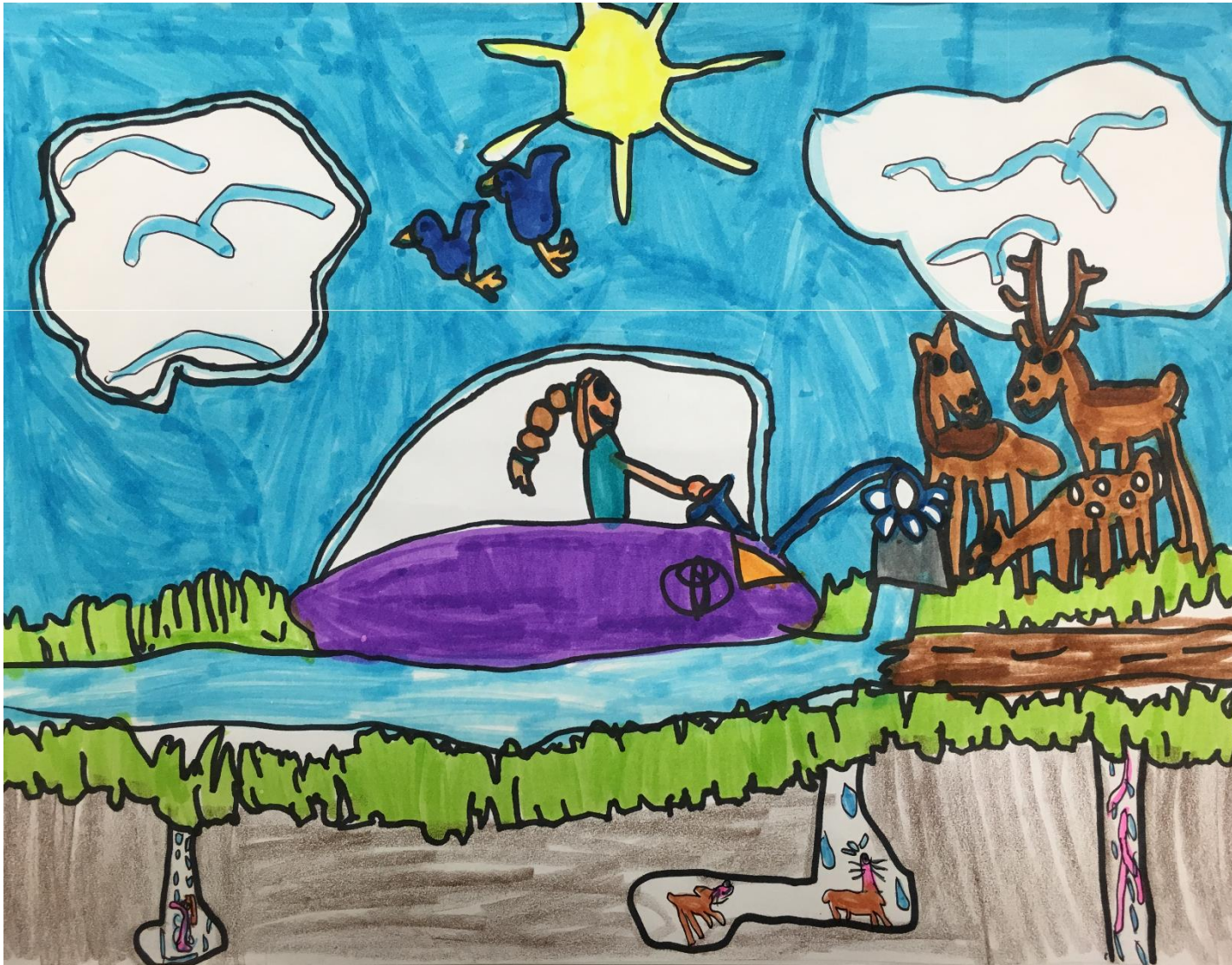
Toyota Water Car by Delphine (age 7)

This is a car that glides over the water it produces. It is eco-friendly and good for animals because it gives them water to drink, dampens the soil and makes trees grow. Even earthworms can take a shower in its exhaust!