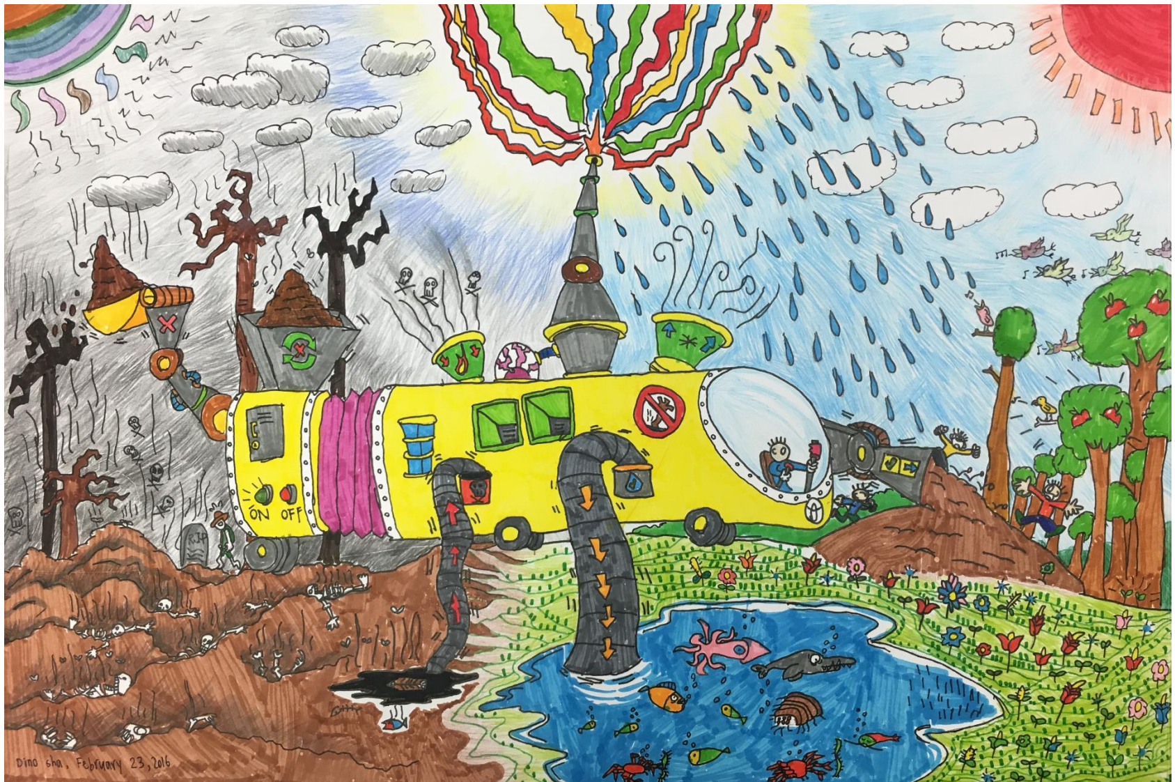
Eco-Drive by Ji An (age 10)

Dino's dream car can help those suffering from heavy pollution. The car purifies contaminated soil, air and water. This way, more people and animals can live long and happy lives again.