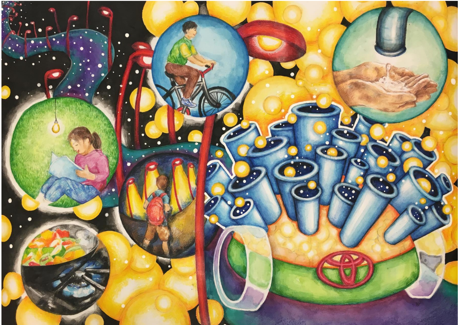
Light of Hope by Yoon (age 15)

My dream car sends light and power wireless to many places and countries in need of it. Due to the car giving off power, it lights up the streets for people to walk at night, gives power to create fire for cooking. Also it gives power for water fountains to pour out drinkable and clean water. The light that my car pours out in the air can fill up the dark night sky for people to walk in the streets late at night without any trouble of being unable to see in the dark. It lets the children in developing countries to read and learn wherever and whenever they wish to. It can reach anywhere around the world because the power that the car gives off can be transported wirelessly. My car can be helpful to many people in all the countries. By driving past the places in need for help, it lights up people's lives, and can give them hope.