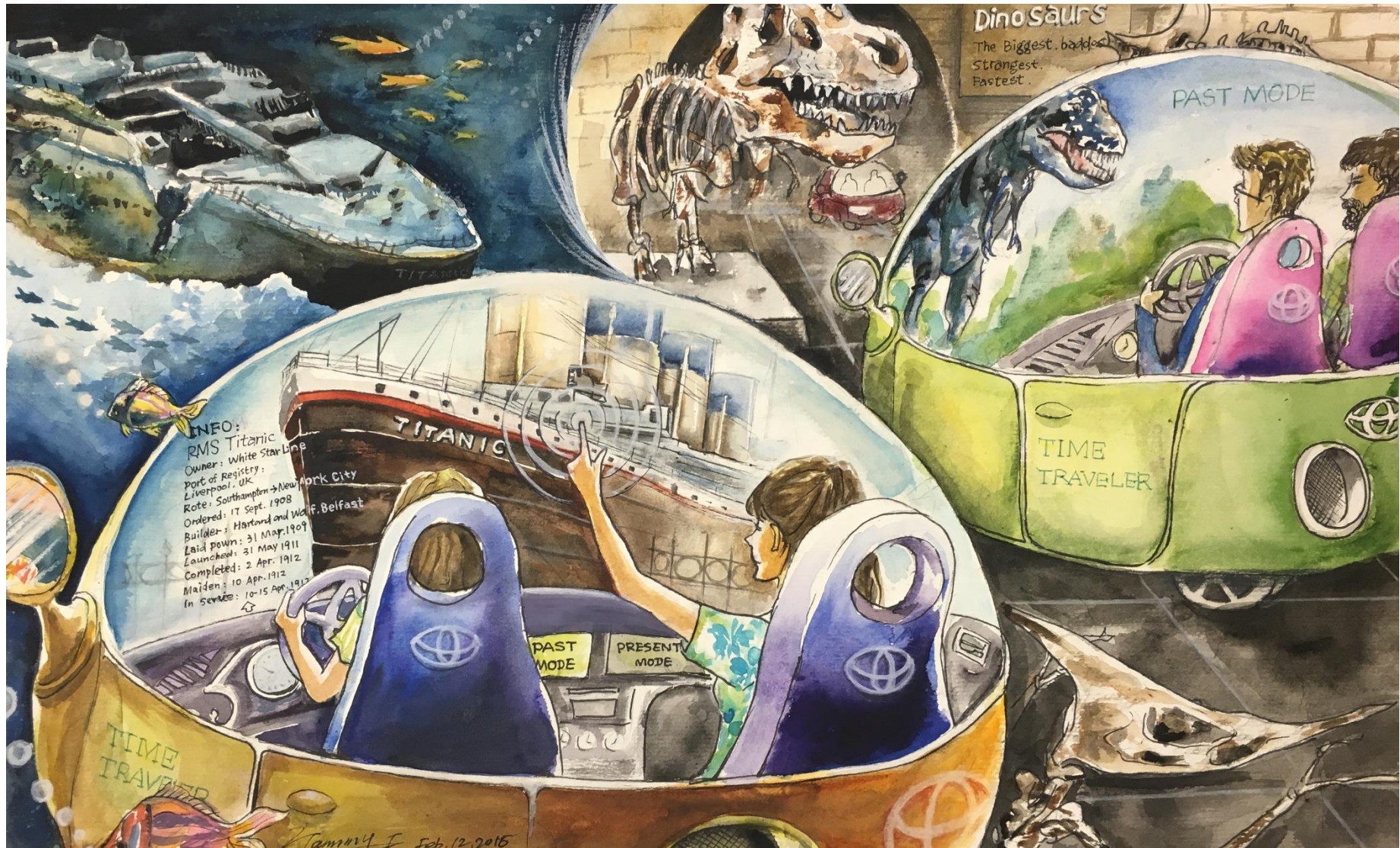
Window to the Past - Toyota Time Traveler by YingJie (age 13)

My dream has been to witness historical events in person. Therefore, I invented the Toyota Time Traveler, the car with a literal window to the past. Imagine yourself travelling beneath the sea, in front of you the monstrous wreck of the Titanic. With an easy flip of a switch, your frontal panoramic window immediately travels back in time to view the actual ship. Indeed, you can view the Titanic in its full glory before its tragic demise. Or perhaps you are visiting the National Dinosaur Museum in Australia and you in awe of the reconstructed skeleton of a Tyrannosaurus-Rex. Just press the "History Button" on the dashboard of your Toyota Time Traveler and instantly watch this ferocious dinosaur come to life. Witness the T-Rex as it actually was when it was alive, but through the safety of the Time Traveler. In addition, by touching the "Information Screen", a running message will provide details on this creature of the past.