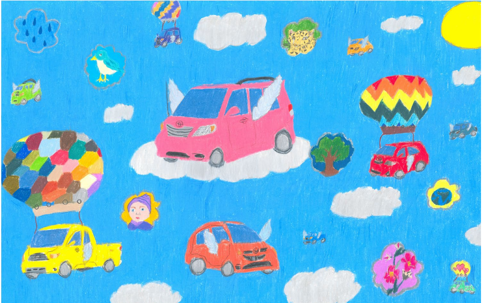
Fuel-Free Flying Car by Brooke (age 10)

This car has wings that make it fly and it uses a hot air balloon like parachute for safe landing. Generations to come will benefit from this car as it doesn't use gas and won't pollute the atmosphere.