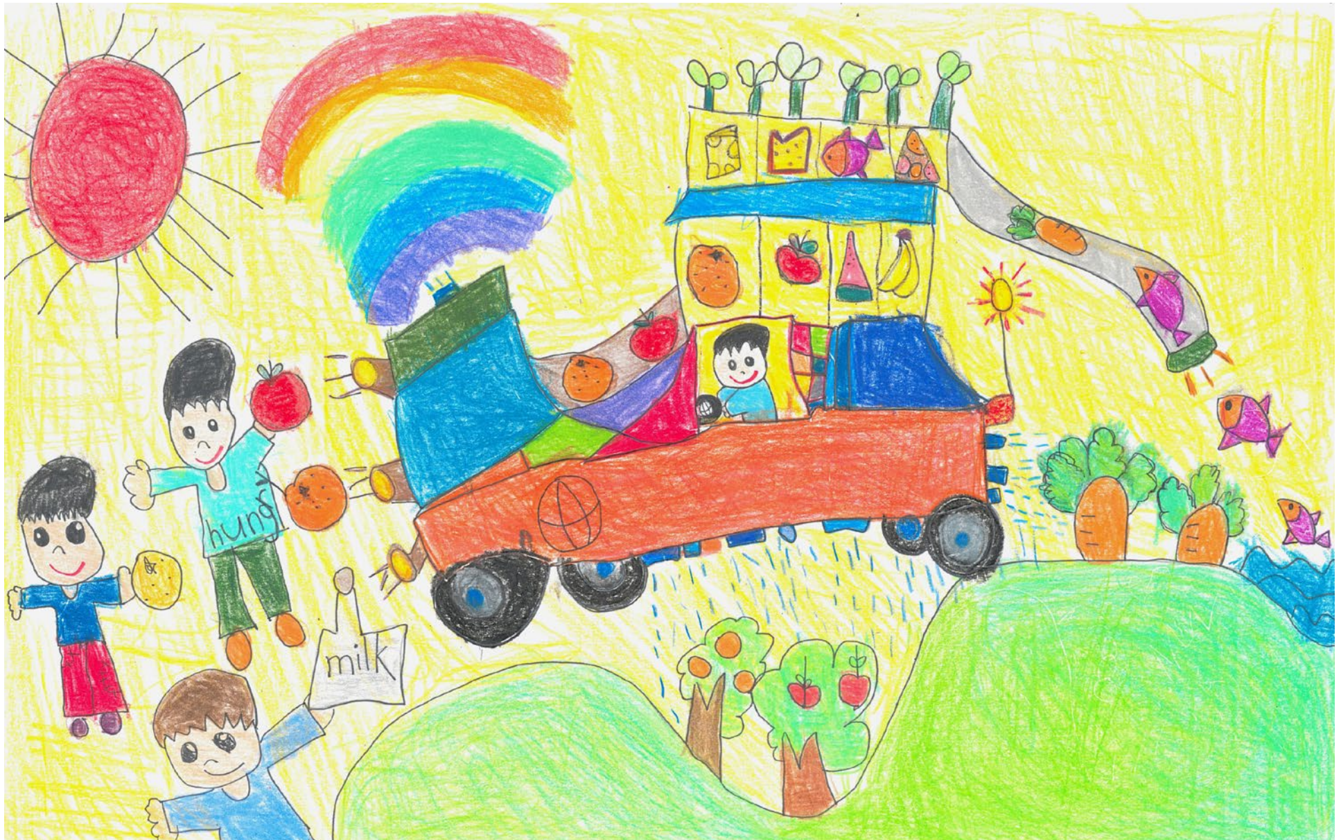
Food Bank Car by Adrian (age 4)

My dream car is a Food Bank Car. I want to help hungry children around the world. The food bank cars go to different villages and cities. They can help irrigate the land, and have suction tubes to collect food from land and sea. Food are stored and cooked in the cars. And when they see children in need, the cars will deliver delicious food to children.