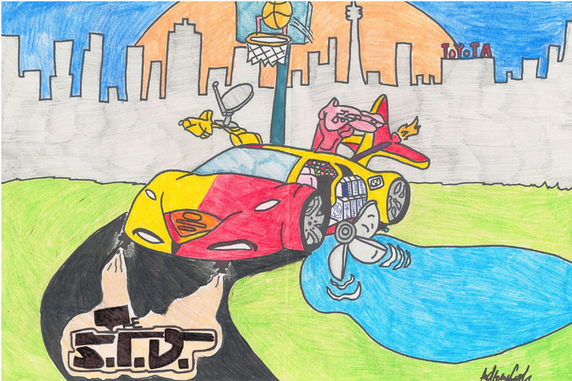
The S.I.D. by Adrian (age 15)

The car has many features it can fly throughout space and in the air. It has a rocket ship launcher attached to the back of the car. It can also go underwater due to the two propellers on both sides of the vehicle. The car has a built in satellite dish this is used to access Wi-Fi wherever and wherever 24/7. Last but not least a basketball net shoots out of the top for people to play basketball. There is also an indoor library and gumball machine for when boredom strikes. Finally the car works on electricity and there is an outlet beside the tires on the left hand side. The doors are gull-wings. Also it can play movies off the projector.