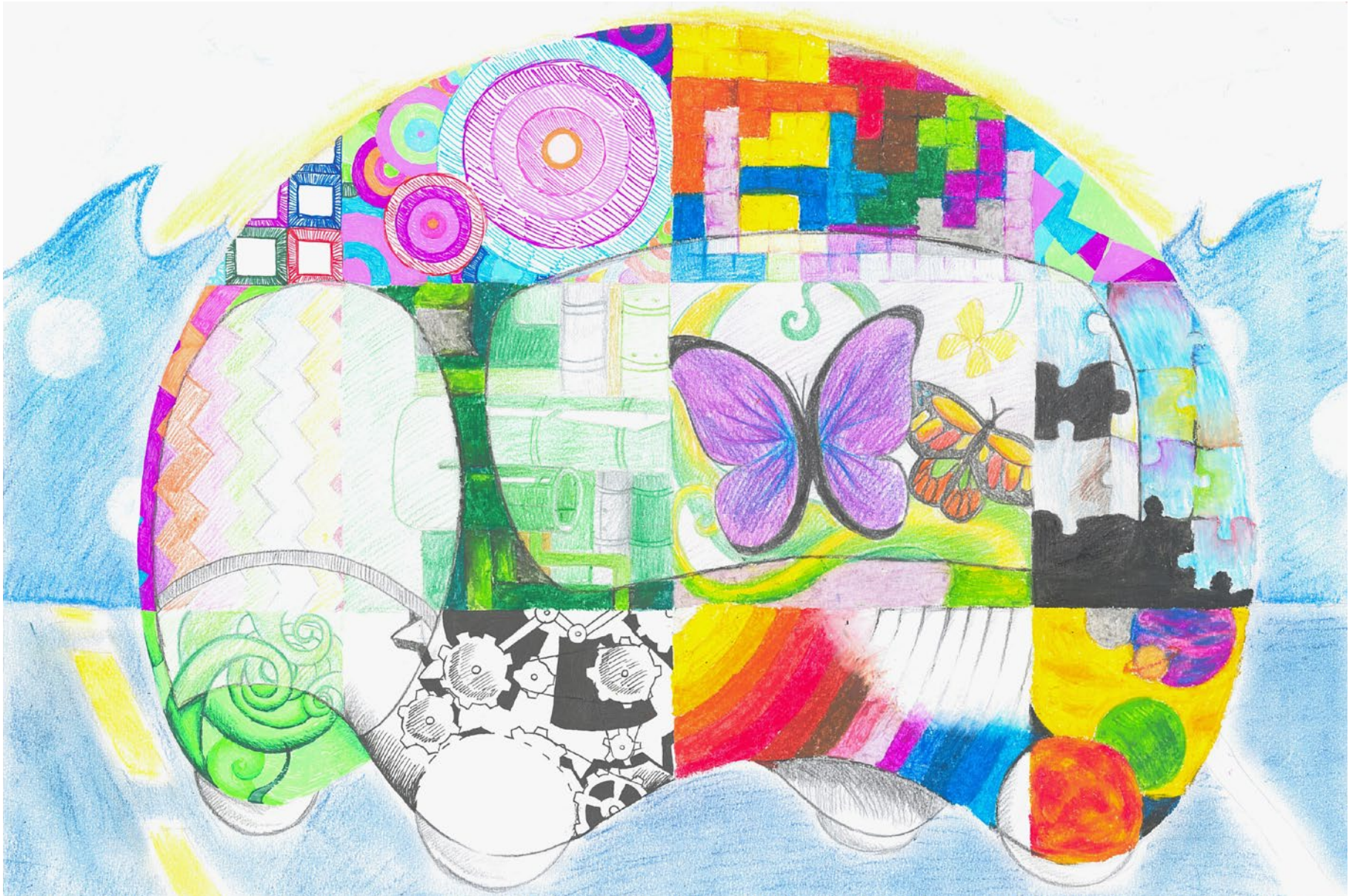
GOTOYO by Yoon (age 12)

My car has a unique design and shape. It's made up of solar panels so it's eco friendly. It also can go under the water. The wheels are globe shaped so it can go every directions. (GOTOYO - GO: Go, TO: To anywhere, YO: TOYOTA)