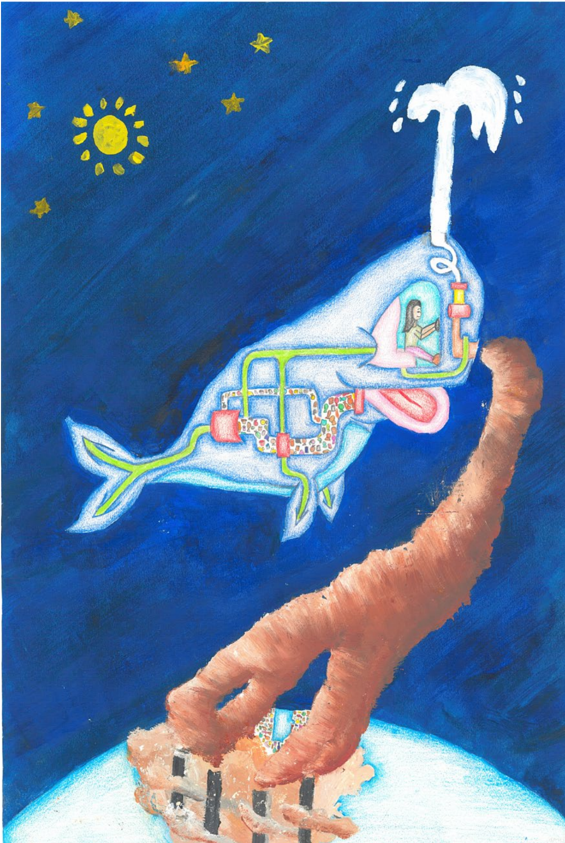
Protector Toyota by Sherry (age 15)

Protector Toyota is designed to function like a whale. It runs on pollution and converts green house gases into sunscreen so that it can protect Earth from the sun's damaging radiation.