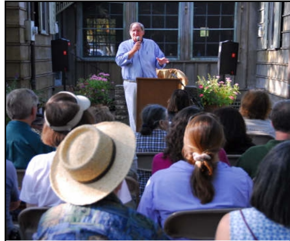
Keynote Speaker Senator Robert Smith addresses members, friends, supporters and honorees of TAS at the 2007 Wingding!