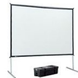
Da-Lite 6'x8' Screen