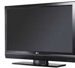
19" VGA Monitor