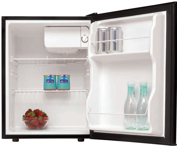
Kenmore 2.4 cu. ft. Manual Defrost