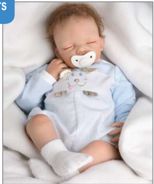
Luke, Pawprints Puppy