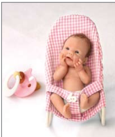
Silly Me and Bouncy Seat