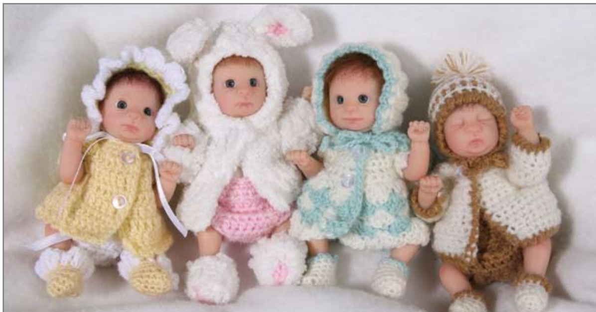
Fresh As A Daisy