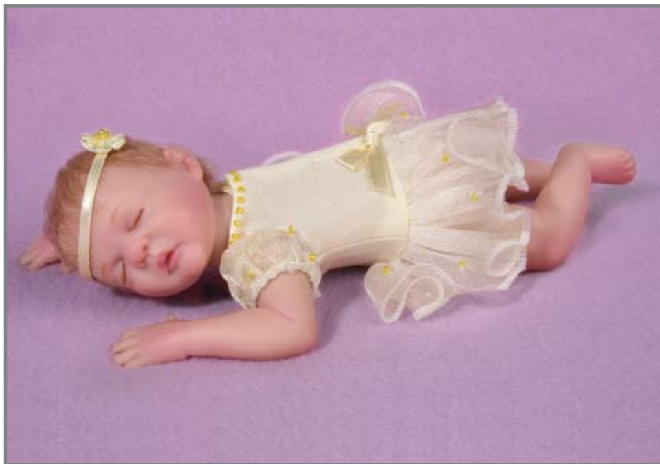
Tutu Tuckered Out Ballerina