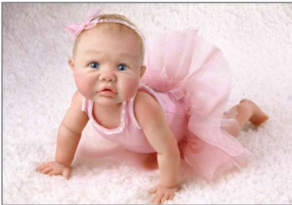
Tutu Tiny Ballerina