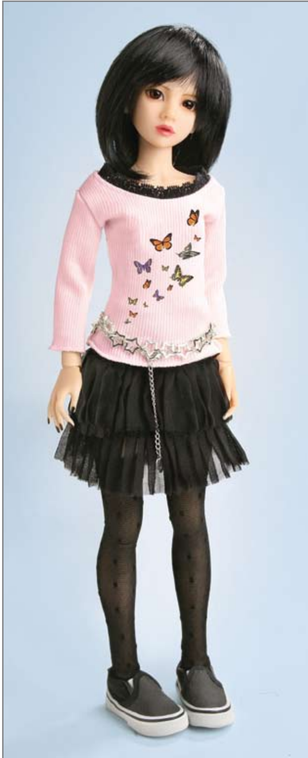
Delilah Good Girl