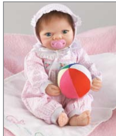
Emmy's Going To The Beach Outfit