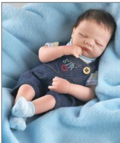
Charlie's Going To Grandma's Outfit