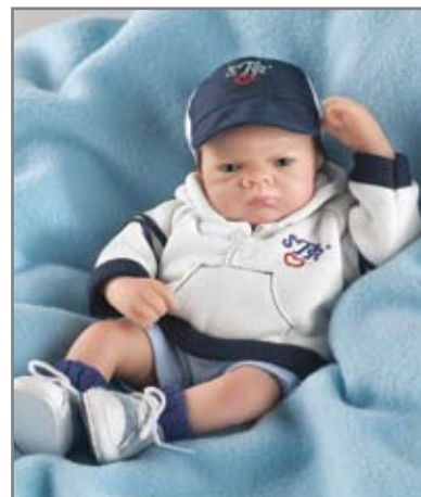
Charlie's Going To The Park Outfit