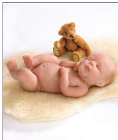
Silly Me with Teddy Bear