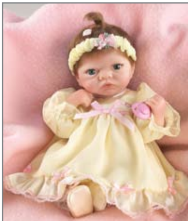
Emmy's Party Ensemble