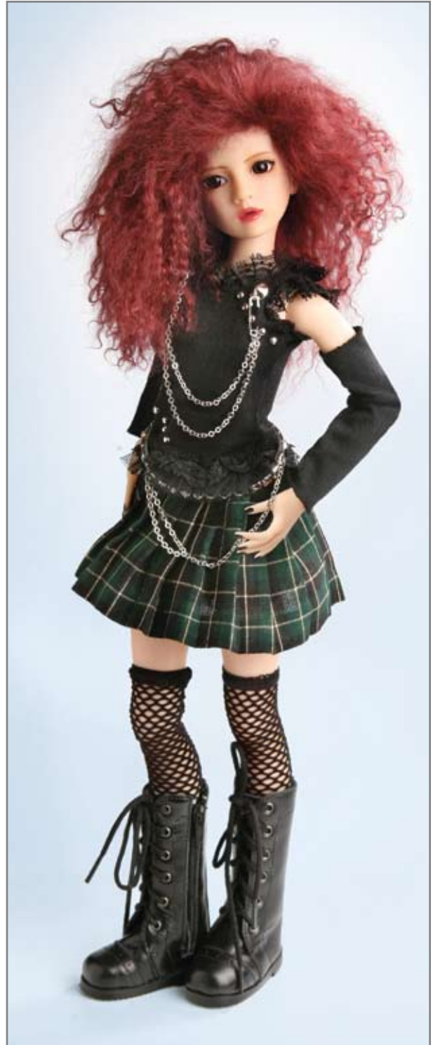
Delilah Bad Girl Outfit and Wig