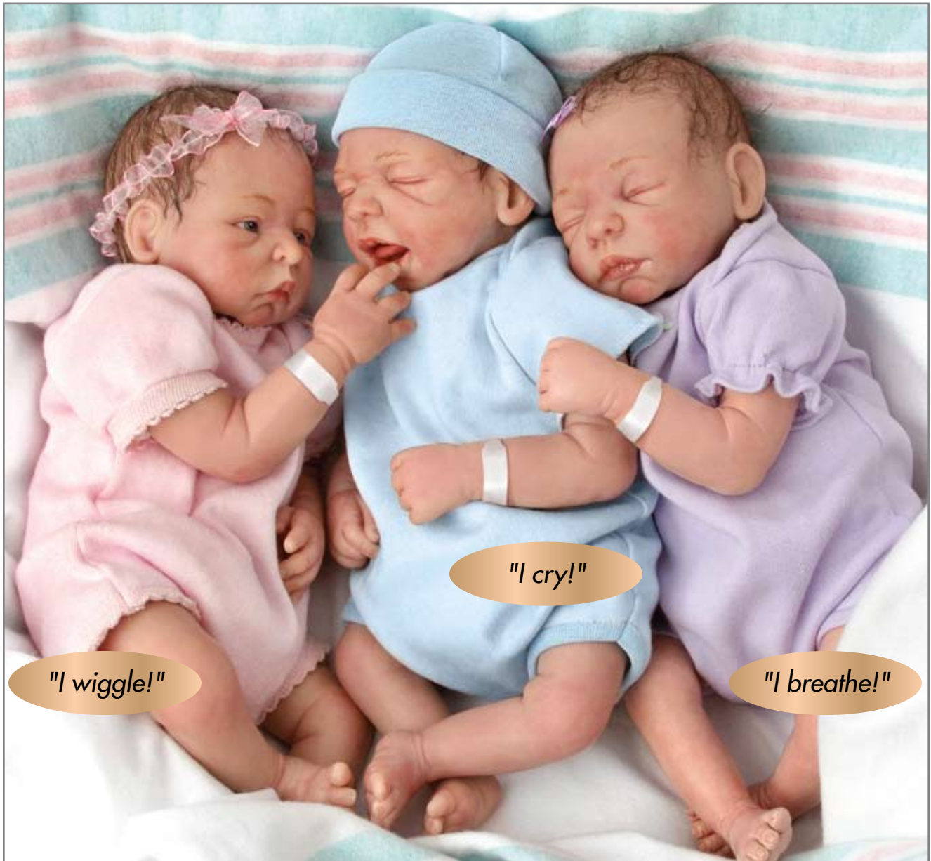
Bless You Baby - Wiggler