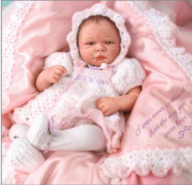
Love at First Sight