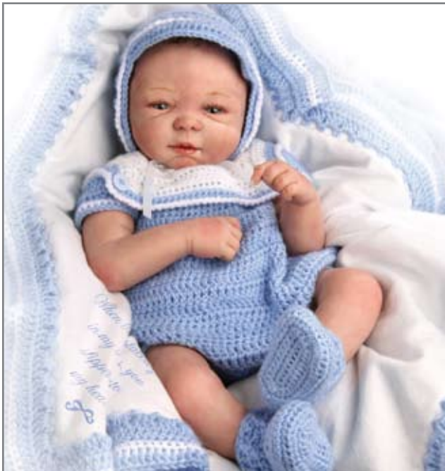
Cherish The Moment