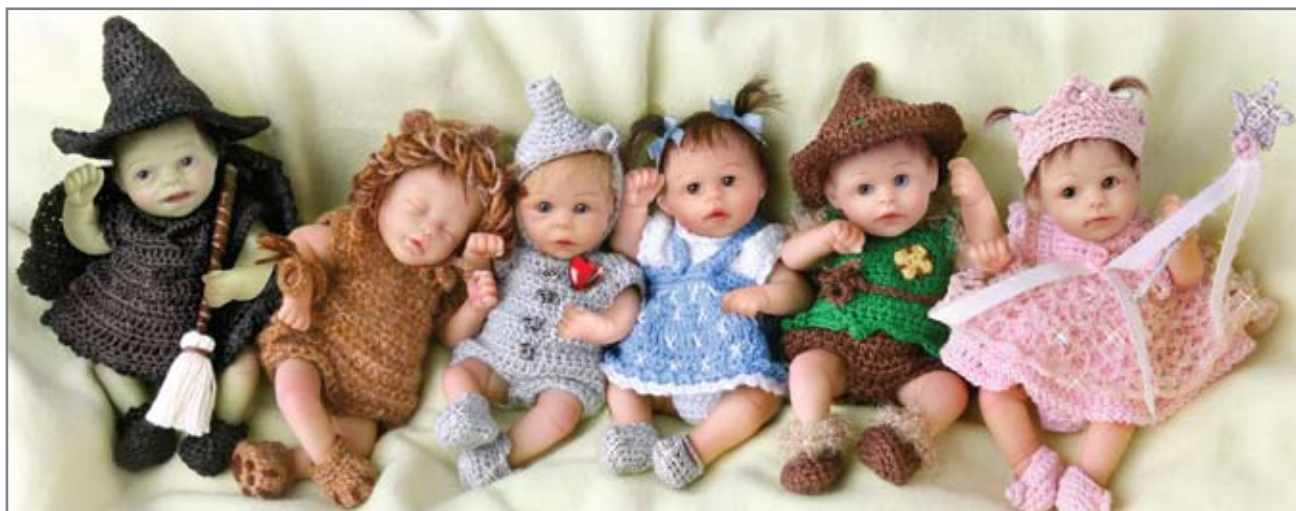
The Wicked Witch