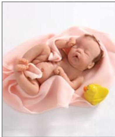
Silly Me Bathtime