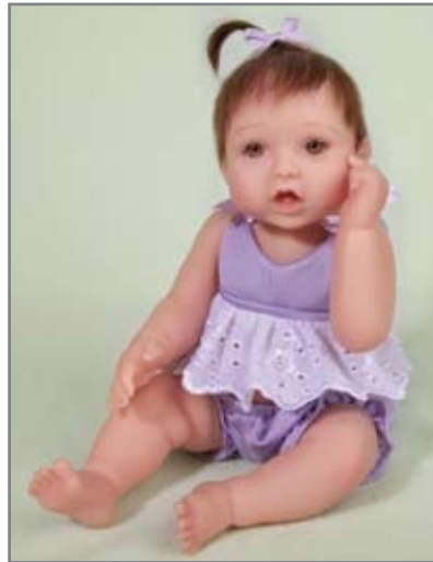
Tiny Kimmie Needs A Cookie