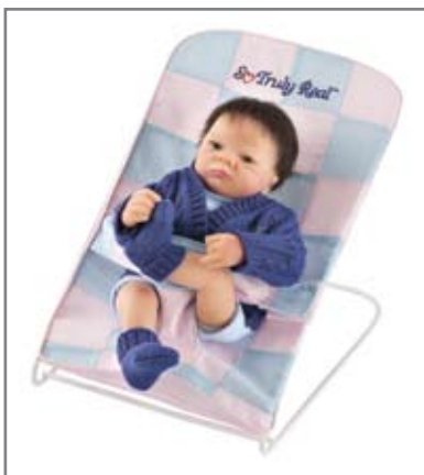
Bouncy Seat for 10" Dolls (Doll not included.)