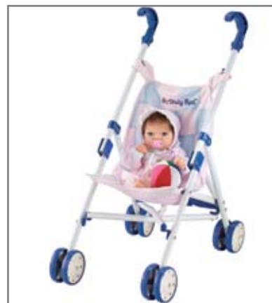
Stroller for 10" Dolls (Doll not included.)