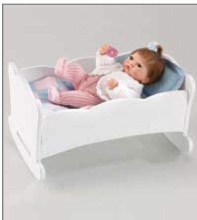
Wood Cradle for 10" Dolls (Doll not included.)