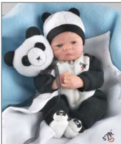
Charlie's Panda Sleeper Outfit