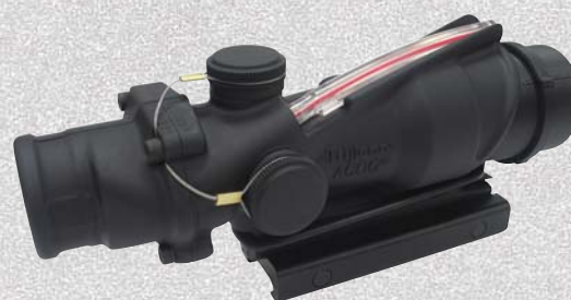
Model TA31 RCO