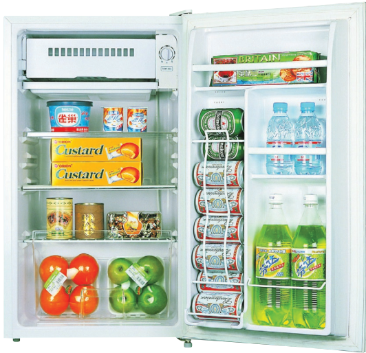
Kenmore 3.3 cu. ft. Manual Defrost