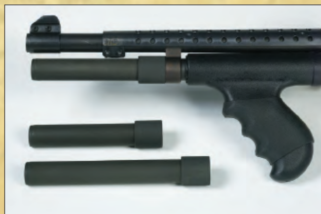
Parkerized Extensions available for Remington 7 & 8 Shot Models

Machined from super-strong chrome moly steel tubing, popular TacStar Magazine Extensions are easy to install. No gunsmithing is needed and most can be removed to return the gun to the original configuration. The seven-shot extension allows for two extra rounds, the eight-shot adds three and the ten-shot adds five more rounds to the shotgun's capacity. Ten-shot extensions include a Barrel/Magazine Clamp. All extensions include a specially calibrated new spring.