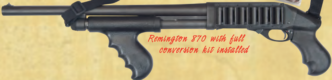
Remington 870 with full conversion kit installed