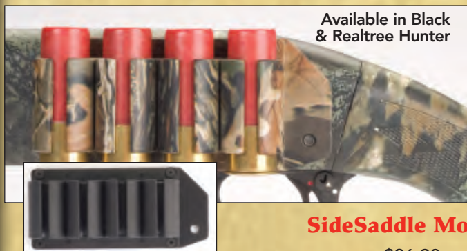
Available in Black & Realtree Hunter