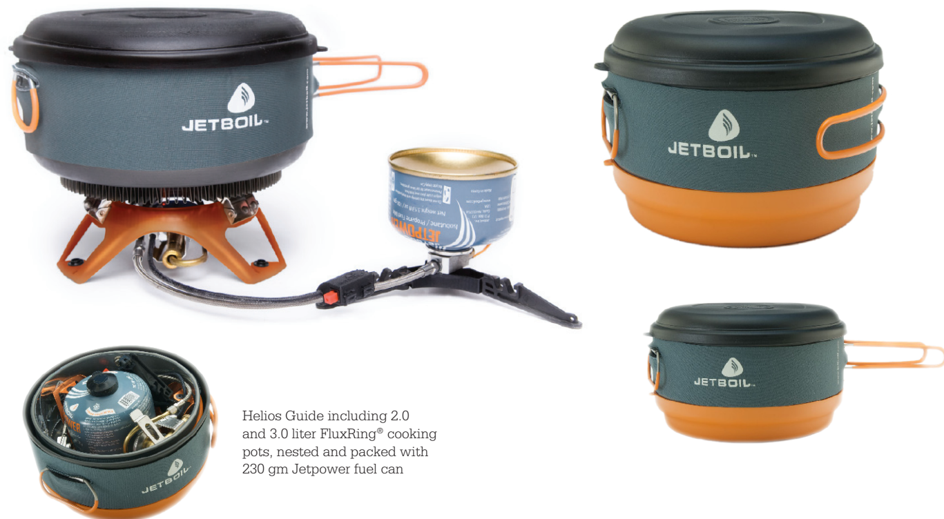
Helios Guide including 2.0 and 3.0 liter FluxRing® cooking pots, nested and packed with 230 gm Jetpower fuel can