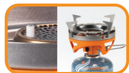
Advanced igniter & Pot Support