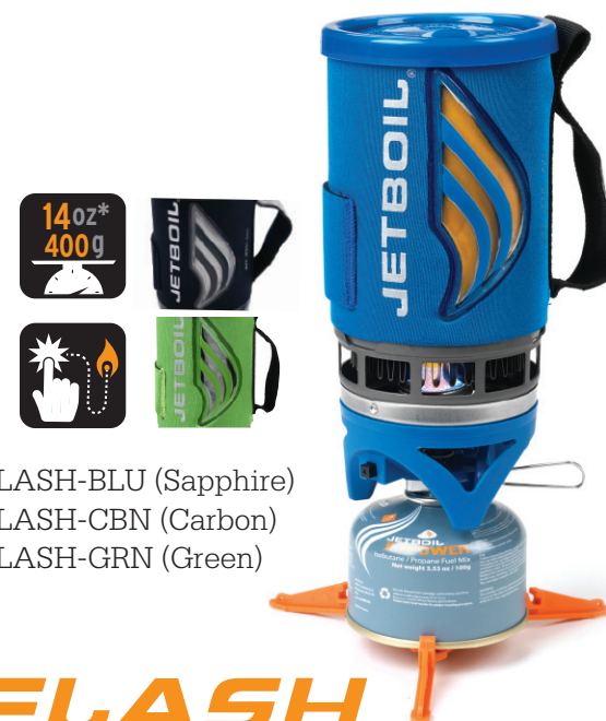
FLASH-BLU (Sapphire) FLASH-CBN (Carbon) FLASH-GRN (Green)

* System weight excludes pot support and fuel stabilizer.