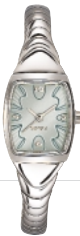
T71651 7-53048-02583-1 ▪ Polished finish