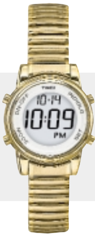
>new> T28402 7-53048-04858-8 ▪ Gold-tone expansion band