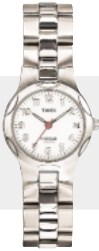
T21462 0-48148-21462-0 ▪ Solid stainless steel metal bracelet with deployment buckle