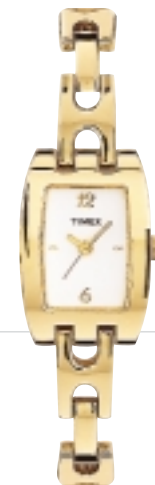
>new> T22742 048148-22742-2 ▪ Gold-tone metal bracelet