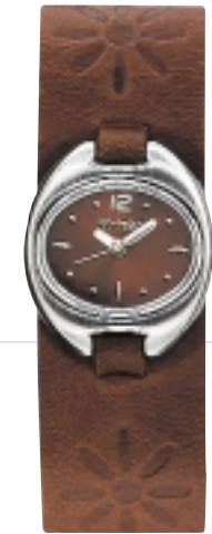
>new> T71441 7-53048-02541-1 ■ Brown leather strap with embossed floral design