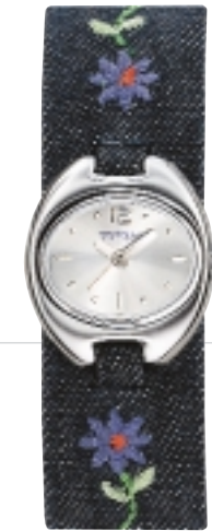
>new> T71431 7-53048-02539-8 ■ Denim strap with stitched flowers