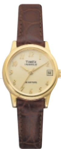
T16132 0-48148-16132-0 ▪ Date ▪ Brown leather strap