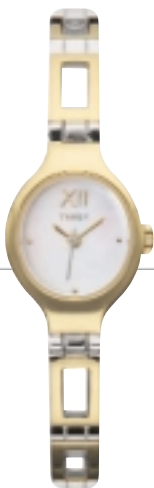
T19371 048148-19371-0 ▪ White mother of pearl dial ▪ Bi-metal bracelet