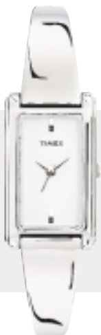
T22881 048148-22881-8 ▪ Silver-tone metal bracelet