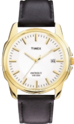
T28482 7-53048-04831-1 ▪ QUICK-DATE® feature ▪ Black leather strap with gold-tone buckle

Look for INDIGLO® night-light on the face of TIMEX watches...another simply brilliant innovation from Timex! The INDIGLO® night-light uniformly lights up the dial at the push of a button.