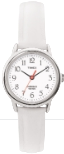
T20412 0-48148-20412-6 ▪ White smooth grain leather strap