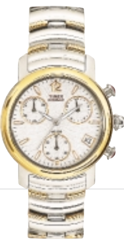
T20582 0-48148-20582-6 ▪ Bi-metal stainless steel metal bracelet with deployment buckle