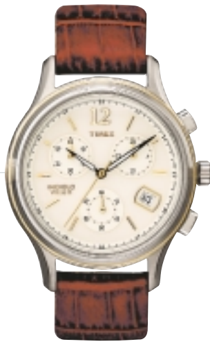
T21813 0-48148-21813-0 ▪ Brown croco grain leather strap