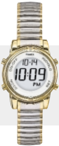
>new> T28412 7-53048-04859-5 ▪ Bi-metal expansion band