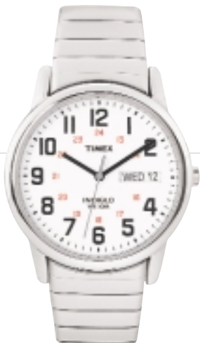
T20461 0-48148-20461-4 ▪ Silver-tone expansion band ▪ QUICK-DATE® feature