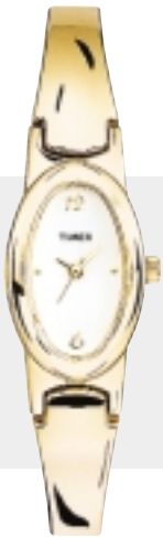
T22991 048148-22991-4 ▪ Gold-tone metal bracelet