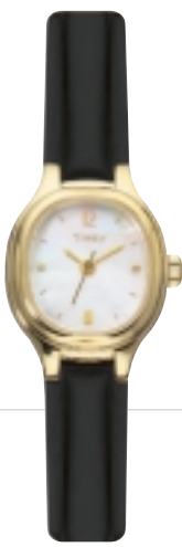
T19311 0-48148-19311-6 ▪ Mother of pearl dial ▪ Black leather strap