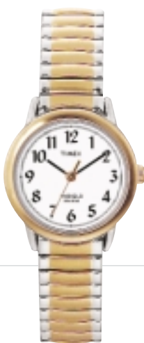
T20451 0-48148-20451-5 ▪ Bi-metal expansion band