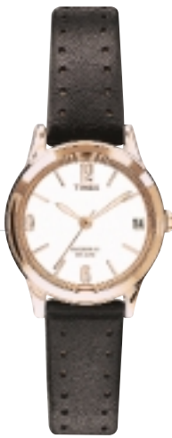
T21683 0-48148-21683-9 ▪ Rose gold tone case and buckle ▪ QUICK-DATE® feature ▪ Black leather strap