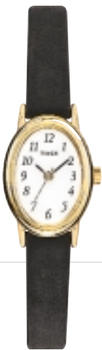
T21912 0-48148-21912-0 ▪ Black leather strap