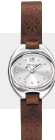
>new> T71381 7-53048-0529-9 ■ Brown leather strap with embossed floral design