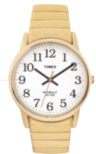
T20481 0-48148-20481-2 ▪ Gold-tone expansion band

< The Timex® fashion line includes timeless classics, a dressy collection, and the trendy TMX® styles—just right for any lifestyle.