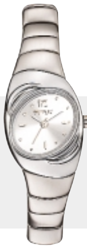
T72281 7-53048-02626-5 ▪ Brushed finish