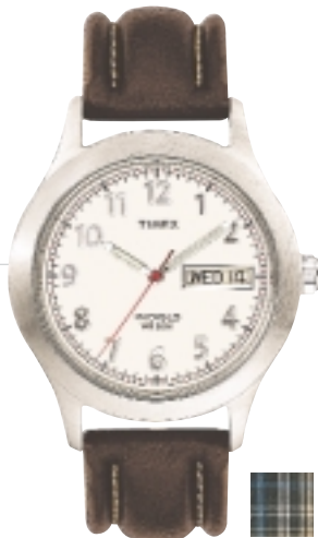
T21553 0-48148-21553-5 ▪ Brown leather strap with contrast stitching and plaid fabric lining