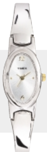
T23182 048148-23182-5 ▪ Silver-tone metal bracelet