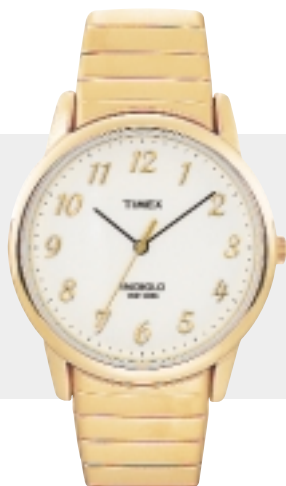
T20021 0-48148-20021-0 ▪ Gold-tone expansion band