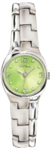
T73121 0-48148-73121-9 ▪ Brushed and polished finish