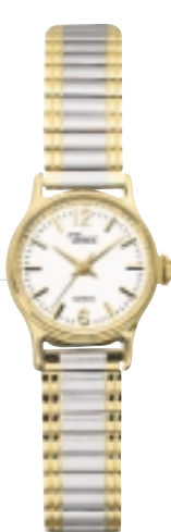
T53822 0-48148-53822-1 ▪ Bi-metal expansion band