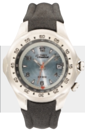
T19404 0-48148-19404-5 ▪ Black leather strap