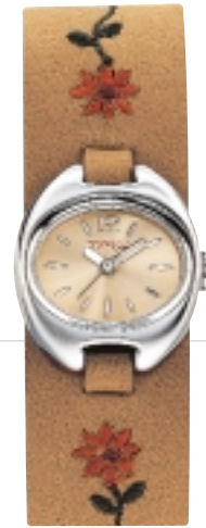
>new> T71451 7-53048-02544-2 ■ Tan suede strap with stitched flowers