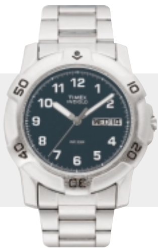
T15367 0-48148-15367-7 ▪ Metal bracelet with foldover clasp