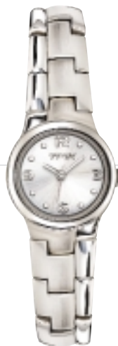
T73261 0-48148-73261-2 ▪ Brushed and polished finish

Styles T74152, T73071, and T73091 are covered by U.S. Patent No. D413,525. Styles T71612, and T71601 are covered by U.S. Patent No. D449,997.*Battery life estimates are based on certain assumptions regarding usage: battery life may vary depending on actual usage. See back inside cover for trademark ownership and registration information.