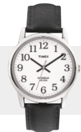
T20501 0-48148-20501-7 ▪ Black smooth grain leather strap