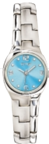
T73171 0-48148-73212-4 ▪ Brushed and polished finish