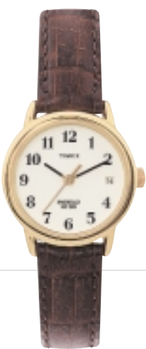
T20071 0-48148-20071-5 ▪ Brown croco-grain leather strap ▪ QUICK-DATE® feature