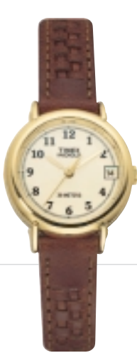
T16091 0-48148-16091-0 ▪ Date ▪ Brown leather strap