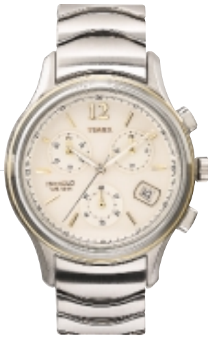
T21782 0-48148-21782-9 ▪ Silver-tone stainless steel metal bracelet with deployment buckle