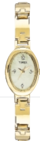
>new> T19582 7-53048-02089-8 ▪ Gold-tone metal bracelet