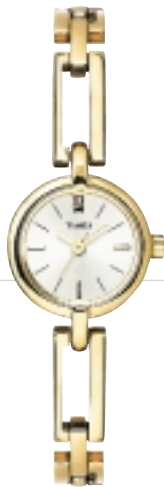
T28692 7-53048-04836-6 ▪ Swarovski® crystals at "12" hour markers