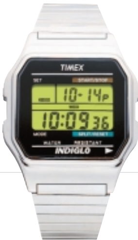
T78587 0-48148-78587-8 ▪ Silver-tone expansion band