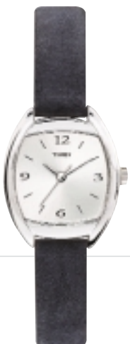
T28772 7-53048-04863-2 ▪ Black leather strap