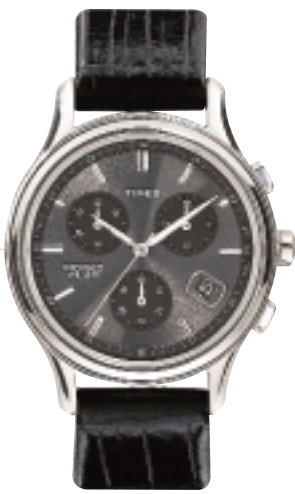
T21823 0-48148-21823-9 ▪ Black croco grain leather strap

< Chronographs with INDIGLO® night-light are another industry first offered by Timex.