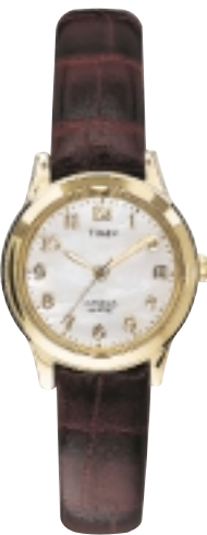
T21693 0-48148-21693-8 ▪ Mother of pearl dial ▪ QUICK-DATE® feature ▪ Burgundy croco grain leather strap