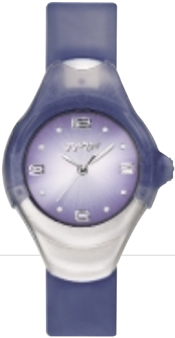
>new> T74152 0-48148-74152-2 ▪ Plum translucent resin strap ▪ High gloss bezel