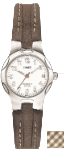
T21534 0-48148-21534-4 ▪ Brown leather strap with contrast stitching and gingham fabric lining