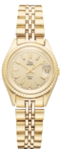
T32227 0-48148-32227-1 ▪ Date ▪ Gold-tone metal bracelet