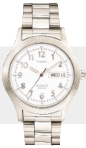
T21573 0-48148-21573-3 ▪ Solid stainless steel metal band with deployment buckle