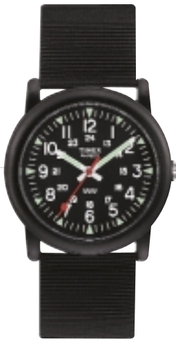
T18581 7-53048-96424-6 ▪ Black grosgrain nylon strap