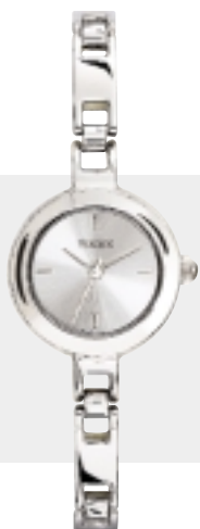
T22932 0-48148-22932-7 ▪ Silver-tone metal bracelet