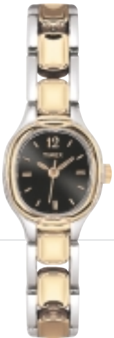
T19861 0-48148-19861-6 ▪ Bi-metal bracelet