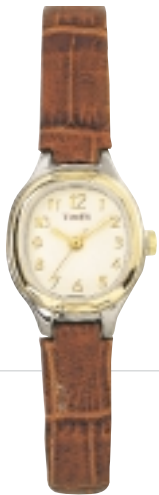
T23241 0-48148-23241-9 ▪ Brown croco grain leather strap