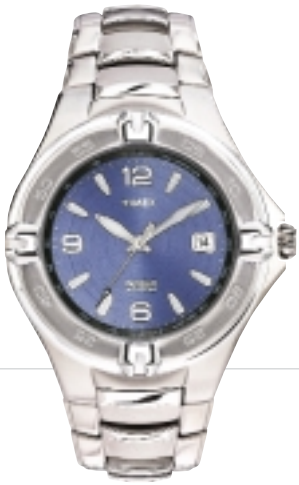
>new> T28812 7-53048-04850-2 ▪ Silver-tone metal band with deployment buckle