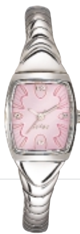
T71661 7-53048-02585-5 ▪ Polished finish