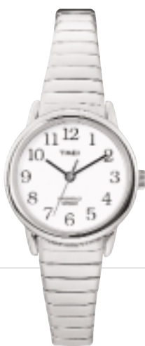
T20061 0-48148-20061-6 ▪ Silver-tone expansion band