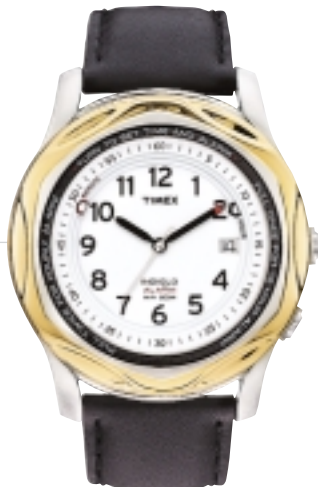
T28532 7-53048-04840-3 ▪ Black leather strap