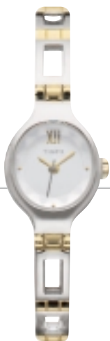
T19361 048148-19361-1 ▪ Faceted crystal ▪ Bi-metal bracelet