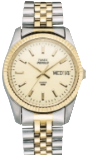
T32747 0-48148-92740-7 ▪ QUICK-DATE® feature ▪ Bi-metal band