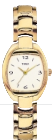
T28752 7-53048-04861-8 ▪ Gold tone metal bracelet