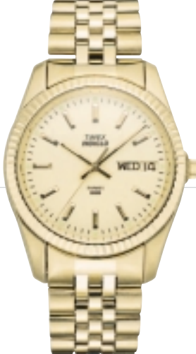
T32827 0-48148-32827-3 ▪ QUICK-DATE® feature ▪ Gold-tone band