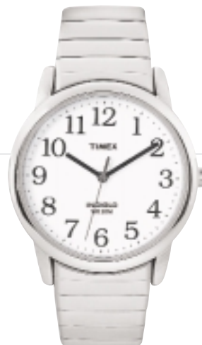
T20001 0-48148-20001-2 ▪ Silver-tone expansion band

The QUICK-DATE® feature allows the user to set the date on the watch directly when the crown stem is halfway out. No more turning watch hands to reset the date!