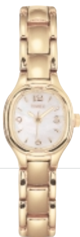
T19822 0-48148-19822-7 ▪ Mother of pearl dial ▪ Gold-tone metal bracelet