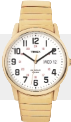
T20471 0-48148-20471-3 ▪ Gold-tone expansion band ▪ QUICK-DATE® feature