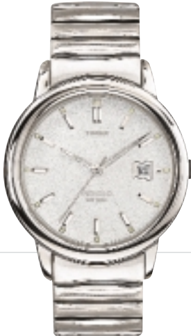
T21962 0-48148-21962-5 ▪ QUICK-DATE® feature ▪ Silver-tone expansion band