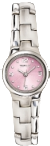
T73212 0-48148-73261-2 ▪ Brushed and polished finish