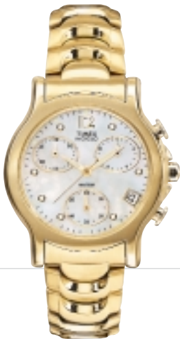
T20523 0-48148-20523-9 ▪ Mother of pearl dial ▪ Swarovski® crystals ▪ Gold-tone stainless steel metal bracelet with deployment buckle