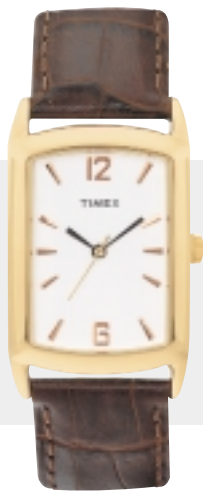
T19681 0-48148-19681-0 ▪ Brown croco grain leather strap