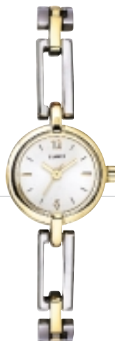
T28672 7-53048-04834-2 ▪ Bi-metal bracelet