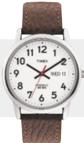
T20041 0-48148-20041-8 ▪ Brown leather strap ▪ QUICK-DATE® feature