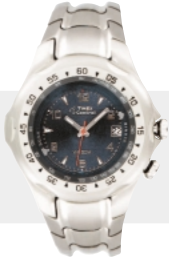
T19281 0-48148-19281-2 ▪ Metal bracelet with deployment buckle