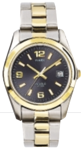
T23231 0-48148-23231-0 ▪ Bi-metal metal band