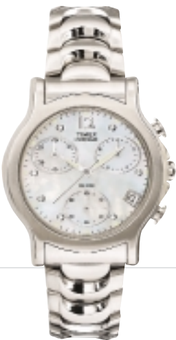
T20511 0-48148-20511-6 ▪ Mother of pearl dial ▪ Swarovski® crystals ▪ Silver-tone metal bracelet with deployment buckle