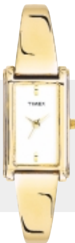
T22891 048148-22891-7 ▪ Gold-tone metal bracelet