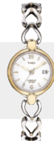
>new> T28372 7-53048-04825-0 ▪ QUICK-DATE® feature with Easy Reader® date ▪ Bi-metal bracelet

< With its detailing and design, Timex® fashion watches prove that dress watches do not have to be expensive.