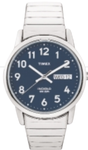
T20031 0-48148-20031-9 ▪ Silver-tone expansion band ▪ QUICK-DATE® feature