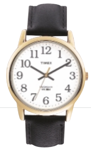
T20491 0-48148-20491-1 ▪ Black leather strap