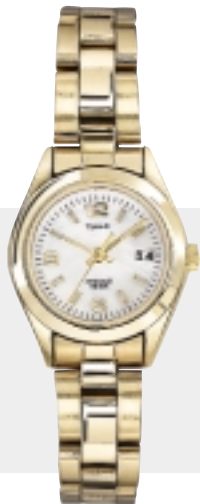
T23161 0-48148-23161-0 ▪ Mother of pearl dial ▪ Easy Reader® date ▪ Gold-tone metal bracelet