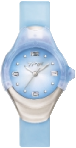
T73071 0-48148-73071-7 ▪ Ice blue translucent resin strap ▪ Iridescent high gloss bezel