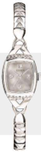
T21922 0-48148-21922-9 ▪ Swarovski® crystals ▪ Mother of pearl dial ▪ Silver-tone expansion band