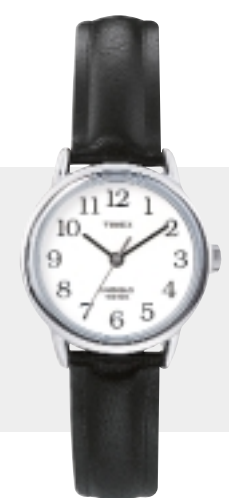
T20441 0-48148-20441-6 ▪ Black smooth grain leather strap