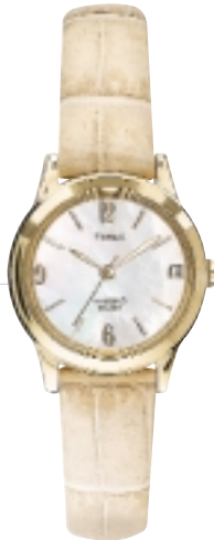
T21672 0-48148-21672-3 ▪ Mother of pearl dial ▪ QUICK-DATE® feature ▪ Ivory tone croco grain leather strap