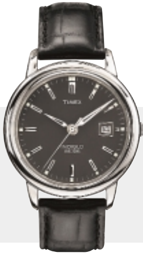
T21752 0-48148-21752-2 ▪ QUICK-DATE® feature ▪ Black croco-grain leather strap