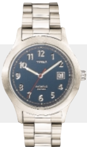
T21582 0-48148-21582-5 ▪ Solid stainless steel metal band with deployment buckle