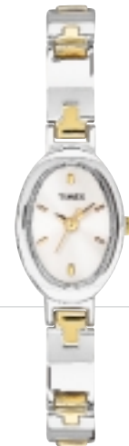
>new> T19802 7-53048-02102-4 ▪ Bi-metal bracelet