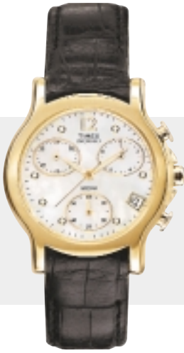
T21452 0-48148-21452-1 ▪ Mother of pearl dial ▪ Swarovski® crystals on dial ▪ Black croco grain leather strap

With a push of the button, Indiglo® night illuminates the entire face—an industry first!