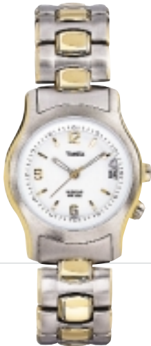
T23001 0-48148-23001-9 ▪ Solid stainless steel metal bracelet with deployment buckle