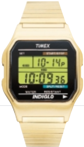
T78677 0-48148-78677-6 ▪ Gold-tone expansion band