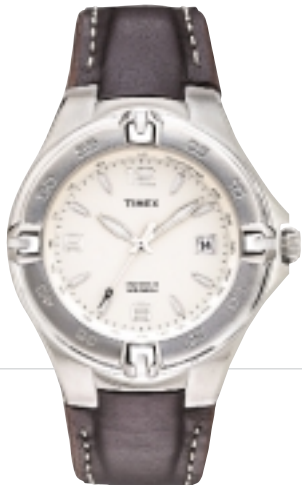
>new> T28622 7-53048-04848-9 ▪ Brown leather strap with contrast stitching and silver-tone buckle