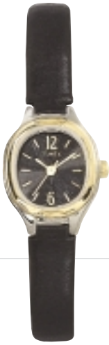
T23251 0-48148-23251-8 ▪ Black leather strap