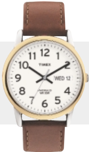
T20011 0-48148-20011-1 ▪ Brown leather strap ▪ QUICK-DATE® feature