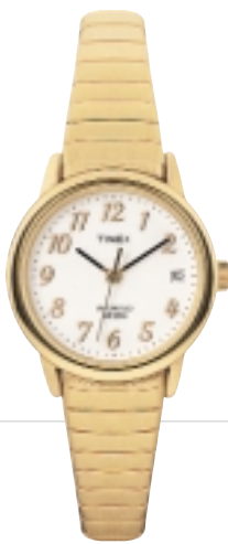
T20081 0-48148-20081-4 ▪ Gold-tone expansion band ▪ QUICK-DATE® feature