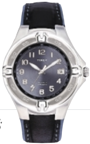
>new> T28612 7-53048-04847-2 ▪ Black leather strap with contrast stitching and silver-tone buckle