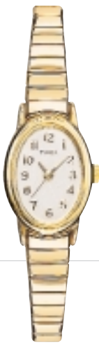
T21882 0-48148-21882-6 ▪ Gold-tone expansion band