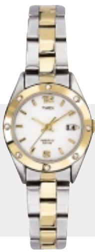
T23191 0-48148-23191-7 ▪ Swarovski® crystals on bezel ring ▪ Easy Reader® date ▪ Bi-metal bracelet