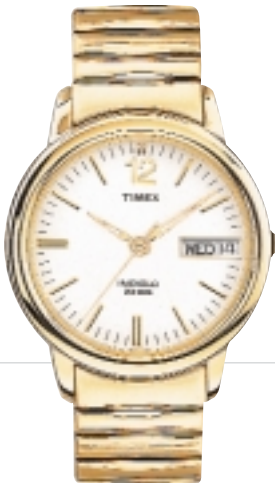
T21942 0-48148-21942-7 ▪ QUICK-DATE® feature ▪ Gold-tone expansion band