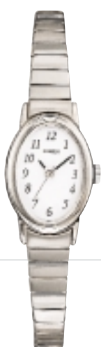
T21902 0-48148-21902-1 ▪ Silver-tone expansion band