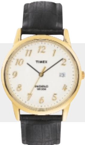
T20051 0-48148-20051-7 ▪ Black croco leather strap ▪ QUICK-DATE® feature