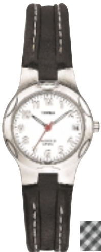
T21472 0-48148-21472-9 ▪ Black leather strap with contrast stitching and gingham fabric lining