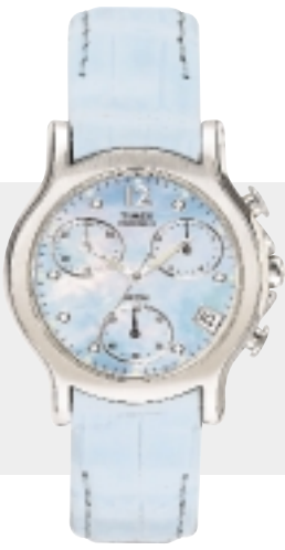
T20532 0-48148-20532-1 ▪ Mother of pearl dial ▪ Swarovski® crystals on dial ▪ Pastel blue croco grain leather strap