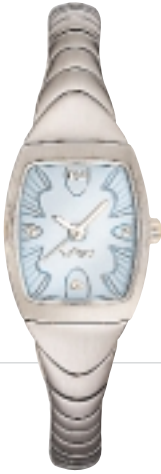
T71641 7-53048-02581-7 ▪ Brushed finish