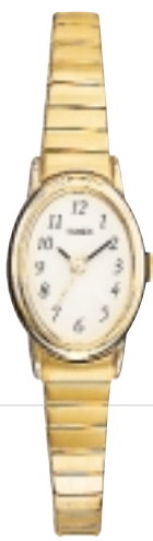
T21872 0-48148-21872-7 ▪ Gold-tone expansion band