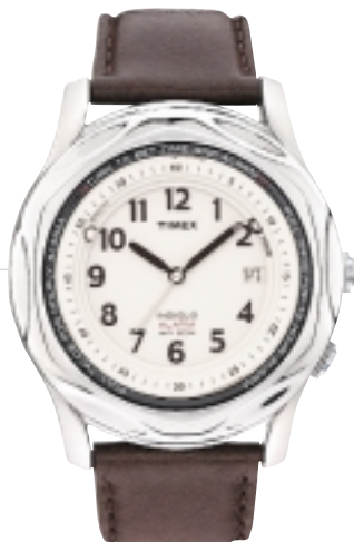
T28562 7-53048-04843-4 ▪ Brown leather strap