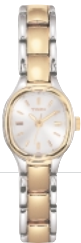
T19831 0-48148-19831-9 ▪ Bi-metal bracelet