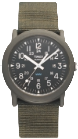
T41711 0-48148-30317-1 ▪ Olive green grosgrain nylon strap