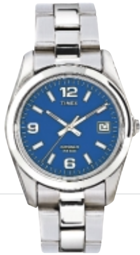
T29012 0-48148-29012-9 ▪ Matte and gloss silver-tone metal band