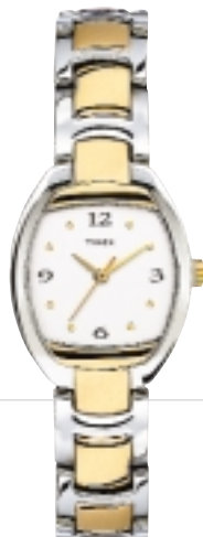
T28762 7-53048-04862-5 ▪ Bi-metal bracelet