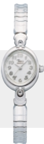
T00917 0-48148-30234-1 ▪ Silver-tone expansion band