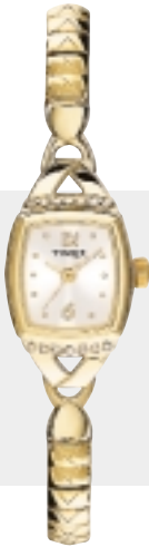
T21932 0-48148-21932-8 ▪ Swarovski® crystals ▪ Gold-tone expansion band