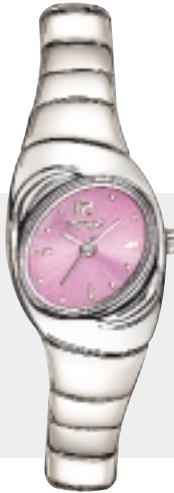
T71612 7-53048-02575-6 ▪ Polished finish