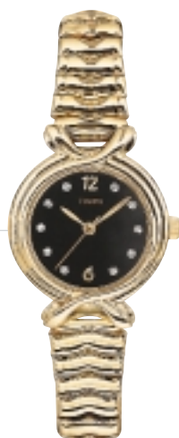
T21832 0-48148-21832-1 ▪ Swarovski® crystals on dial ▪ Gold-tone expansion band