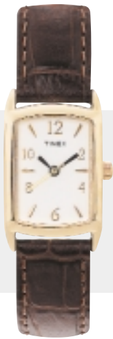
T19871 0-48148-19871-5 ▪ Brown croco grain leather strap