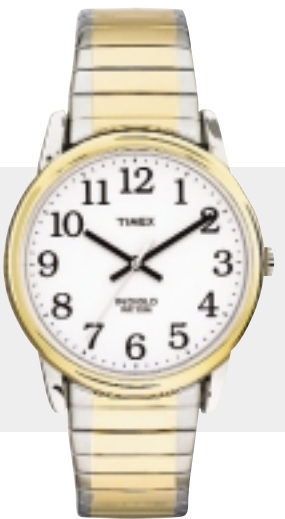
T23811 0-48148-23811-4 ▪ Bi-metal expansion band