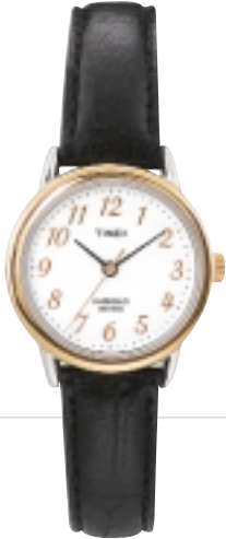
T20101 0-48148-20101-9 ▪ Black croco grain leather strap