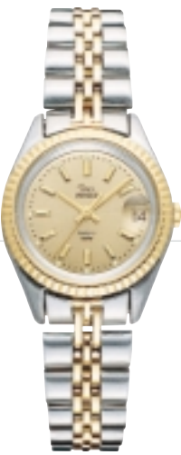
T32157 0-48148-32157-1 ▪ Date ▪ Bi-metal bracelet