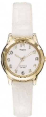
T21703 0-48148-21703-4 ▪ QUICK-DATE® feature ▪ White croco grain leather strap