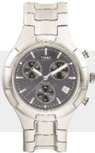
T21442 0-48148-21442-2 ▪ Silver tone metal bracelet with deployment buckle

When the alarm sounds, the Indiglo® night-light flashes.