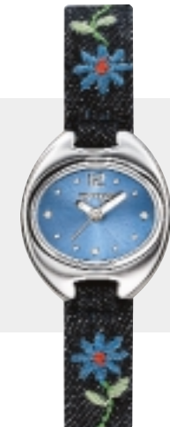
>new> T71371 7-53048-02526-8 ■ Denim strap with stitched flowers