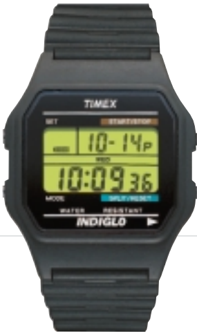
T75961 0-48148-75961-9 ▪ Black resin strap