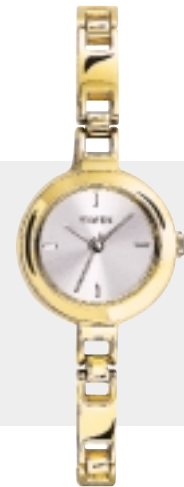
T22952 0-48148-22952-5 ▪ Bi-metal bracelet