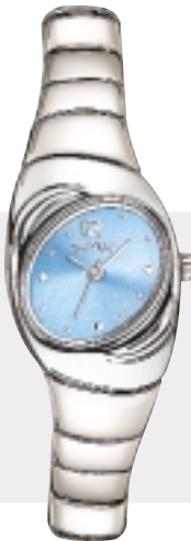
T71601 7-53048-02573-2 ▪ Polished finish