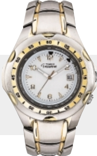
T19291 0-48148-19291-1 ▪ Bi-metal bracelet with deployment buckle