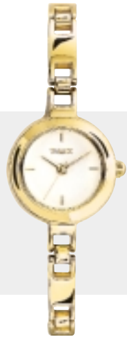
T22942 0-48148-22942-6 ▪ Gold tone metal bracelet