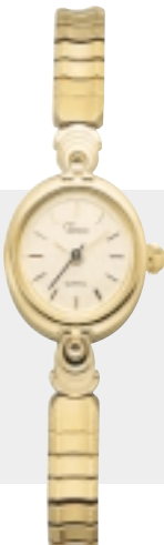
T01017 0-48148-30235-8 ▪ Gold-tone expansion band