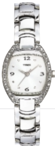
T29441 0-48148-29441-7 ▪ Swarovski® crystals on silver-tone case