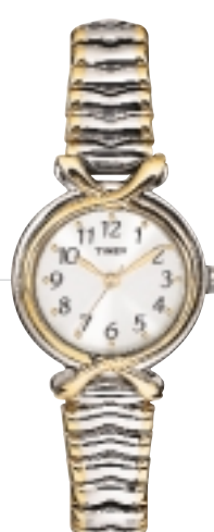
T21854 0-48148-21854-3 ▪ Bi-metal expansion band