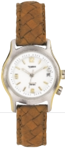
T23031 0-48148-23031-6 ▪ Brown braided leather strap