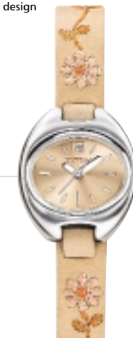
>new> T71391 7-53048-02530-5 ■ Beige leather strap with stitched flowers