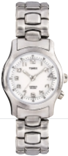
T23011 0-48148-23011-8 ▪ Solid stainless steel metal bracelet with deployment buckle