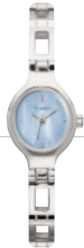
T19391 048148-19391-8 ▪ Blue mother of pearl dial ▪ Silver-tone metal bracelet