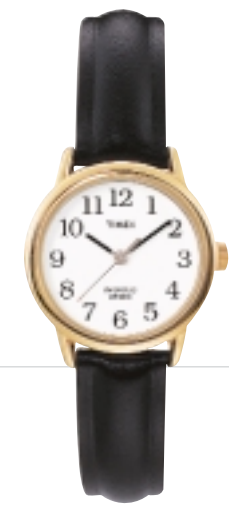
T20433 0-48148-20433-1 ▪ Black leather strap