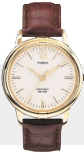
T21734 0-48148-21734-0 ▪ Tan croco-grain leather strap