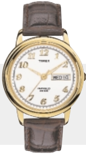
T21713 0-48148-21713-3 ▪ QUICK-DATE® feature ▪ Dark brown croco-grain leather strap