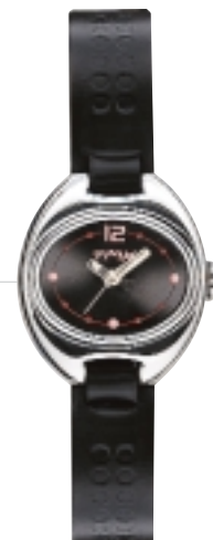
>new> T71401 7-53048-02533-6 ■ Black leather strap with embossed pattern

< Inspired by today's active and youthful consumer, TMX® watches are the perfect combination of fashion and style.