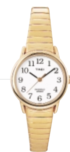
T20423 0-48148-20423-2 ▪ Gold-tone expansion band