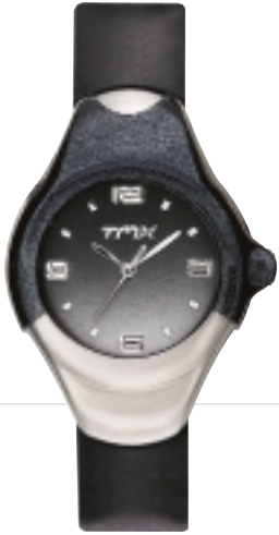
T73091 0-48148-73091-5 ▪ Black translucent resin strap ▪ Metallic high gloss bezel