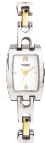
>new> T22832 048148-22832-0 ▪ Bi-metal bracelet