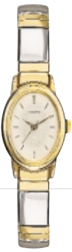
T21864 0-48148-21864-2 ▪ Bi-metal expansion band