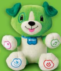
My Pal Scout or Violet • 6-36 months

It's a hope you have for your child and one that LeapFrog shares. As children play with My Pal Scout or Violet, friendly activities encourage them to talk and sing along, developing language skills and starting them on the path to literacy. Get more ideas to support your child's learning at leapfrog.com/learningpath