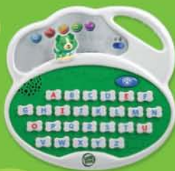
AlphaPet Explorer* • 2+ years