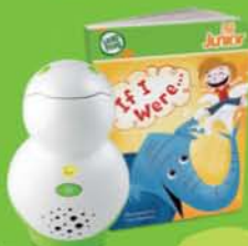
Tag™ Junior Book Pal* • 2-4 years