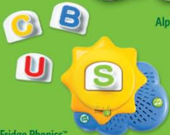
Fridge Phonics™ Magnetic Alphabet* • 2+ years