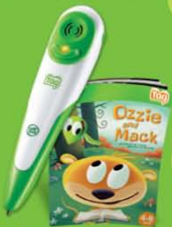
Tag™ Reading System* • 4-8 years