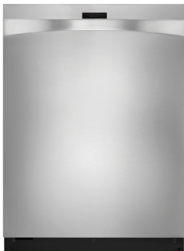
Kenmore Elite Dishwasher with 360° PowerWash™ Technology