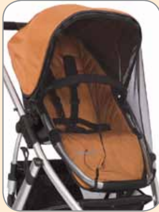
Proper installation of bug shield