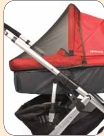
Proper installation of Bassinet bug shield