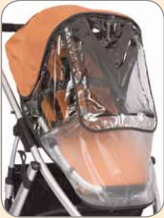
Proper installation of rain shield