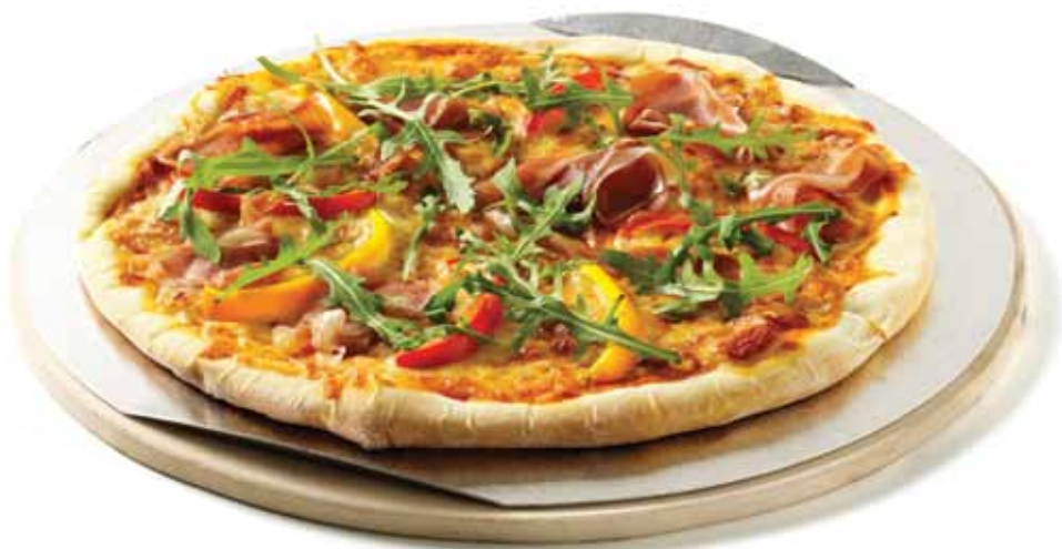
Baby Q™ Pizza Stone

Weber baby Q™ pizza stone with easy-serve pizza tray. Turn your Weber baby Q™ into a pizza oven and enjoy fantastic gourmet pizzas in your own backyard.