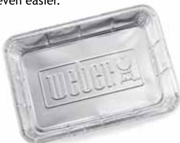
Replacement Drip Trays

Keep your Weber Q clean and dust free with a fitted heavy-duty cover.