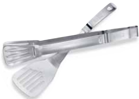
Stainless Steel Tools

Dishwasher proof tongs and spatula are for use with the baby Q™.