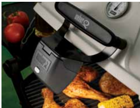
Weber Q™ Handle Light

Enjoy juicier, more succulent roasts. The Weber roasting trivet creates natural convection, allowing super-heated air to circulate all around the meat.