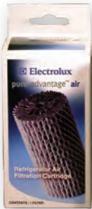
EAF1CBF Pure Advantage™ Replacement Air Filter