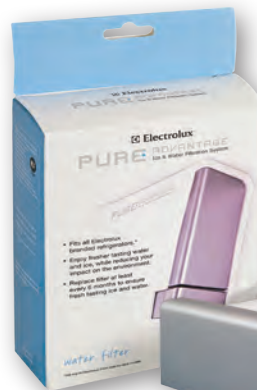
EWF01 Pure Advantage™ Replacement Water Filter