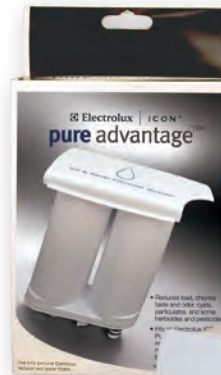
EWF2CBPA Pure Advantage™ Replacement Water Filter