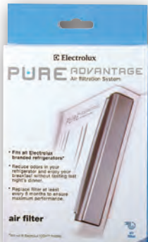
EAFCBF Pure Advantage™ Replacement Air Filter