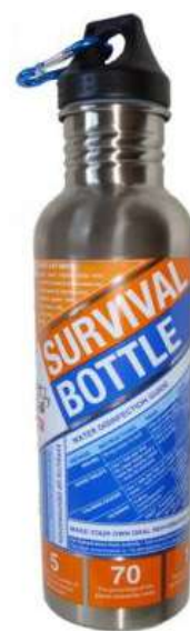
The SOL stainless steel bottle features lifesaving tips on water and hydration

If your trip takes a wrong turn and you happen to get lost or hurt far from help, the Survival Bottle – with its tips on finding and purifying water – could mean the difference between surviving until rescuers reach you," added Meyer.