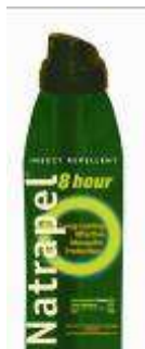
New Natrapel 8 hour's continuous spray bottle provides protection for those hard to reach areas.

“With the introduction of the new Natrapel® formula, Tender is fulfilling a long-standing consumer need for a repellent that works as well as DEET but has none of its perceived health concerns,” he added.