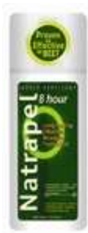
DEET-free protection for 8 hours of activity!