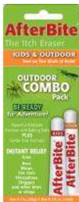
AfterBite® Outdoor Combo Pack includes AfterBite® Kids and AfterBite® Outdoor.

Likewise, families and outdoor enthusiasts need to be equally ready for the bug bites that can happen while on hikes, camping trips and on the beach, where they could also sustain stings from jelly fish and other marine life. For such occasions, Tender offers the AfterBite® Outdoor Combo Pack , featuring AfterBite® Kids and NEW AfterBite® Outdoor . Containing a powerful yet soothing, gel formula of baking soda, ammonia and tea tree oil, Outdoor is the go-to choice for the most aggressive bites and stings.