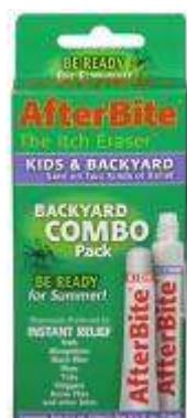
AfterBite® Backyard Combo Pack includes AfterBite® Backyard and AfterBite® Kids.

New for this Spring, Tender Corp. is unveiling two more trusted solutions to help consumers take the Ouch Out of the Outdoors: AfterBite® Backyard and AfterBite® Outdoor . Offering a double shot of bite relief, the Backyard Combo Pack includes a .5 Oz tube of the original, ammonia-based Itch Eraser and a .7 Oz tube of AfterBite® Kids , a cream formula consisting of baking soda, tea tree oil and vitamin E. AfterBite® Kids provides children with gentle relief from the pain and swelling that accompanies the scariest of insect bites and stings that can occur in the backyard.