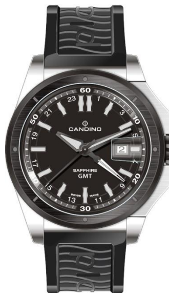
C4473-3 GMT Function