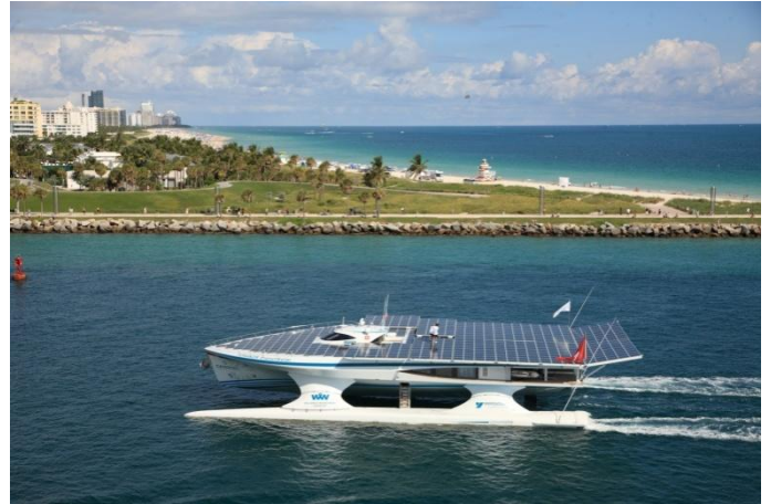
Miami, November 2010

The TÛRANOR PlanetSolar began its journey around the world in Monaco on the 27th September 2010, powered exclusively by solar energy. In Cancun, Mexico the project was invited to the World Climate Conference. At this international, political meeting access was given to the boat for the press and as well for different ambassadors of lots of different countries. The project caused great interest and showed that the solar topic is the spirit of the time. After Mexico the team took a stop in Columbia, Cartagena and afterwards they went directly to the Galapagos Islands, where they presented their partnership with WWF. In the meantime MS TÛRANOR crosses the biggest ocean, the pacific and takes the course to French Polynesia and Australia.