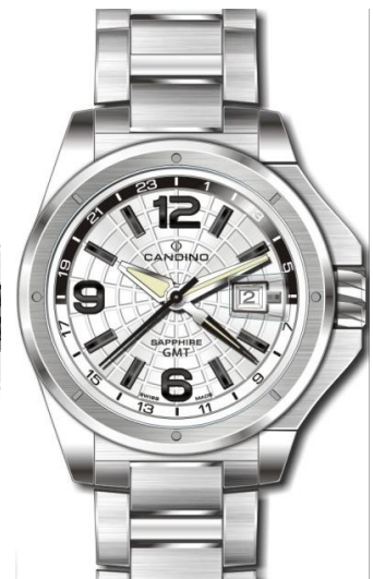
C4451-A GMT Function