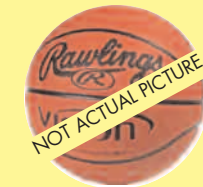
# COMP OHIO