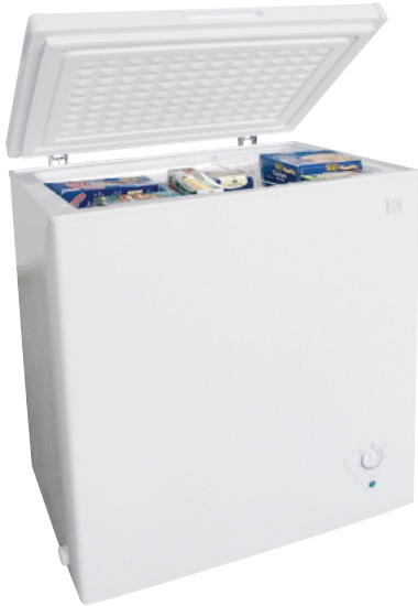
Kenmore 5.1 cu. ft. Chest Freezer