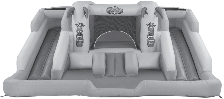
RAINFOREST RAPIDS™ by Blast Zone®

Vortex International Enterprises or any of its subsidiaries may not be held liable for any breach of contract, fiduciary duty, negligence, negligent design, negligent manufacturing, failure to warn for defects in design, materials or workmanship, under any statute, consumer protection legislation, or any regulations passed there under, or for absolutely any other potential cause of action or absolutely any other basis upon which liability may otherwise be found, is strictly limited, without exception, to repair or replacement of the product, at our sole discretion. In no way shall Vortex be responsible for incidental, consequential, resultant or contingent damages of absolutely any type, whatsoever, whether these damages were caused or incurred by our breach of contract or negligence or by any other cause whatsoever. If any part of this warranty, exclusion, disclaimer and limitation of liability clause is determined to be invalid or unenforceable in whole or in part, such invalidity or unenforceable provision will attach only to such provision or part thereof and the remaining part of such provision and all other provision will continue in full force and effect. Vortex reserves the right to change or modify this product within reason without notice, and without obligation to modify existing products.