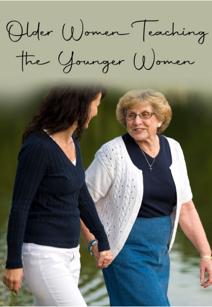
Older Women Teaching the Younger Women