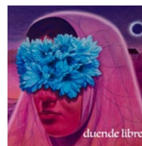
Duende Libre Duende Libre