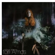
Native Invader Tori Amos