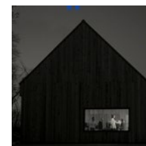
Sleep Well Beast The National