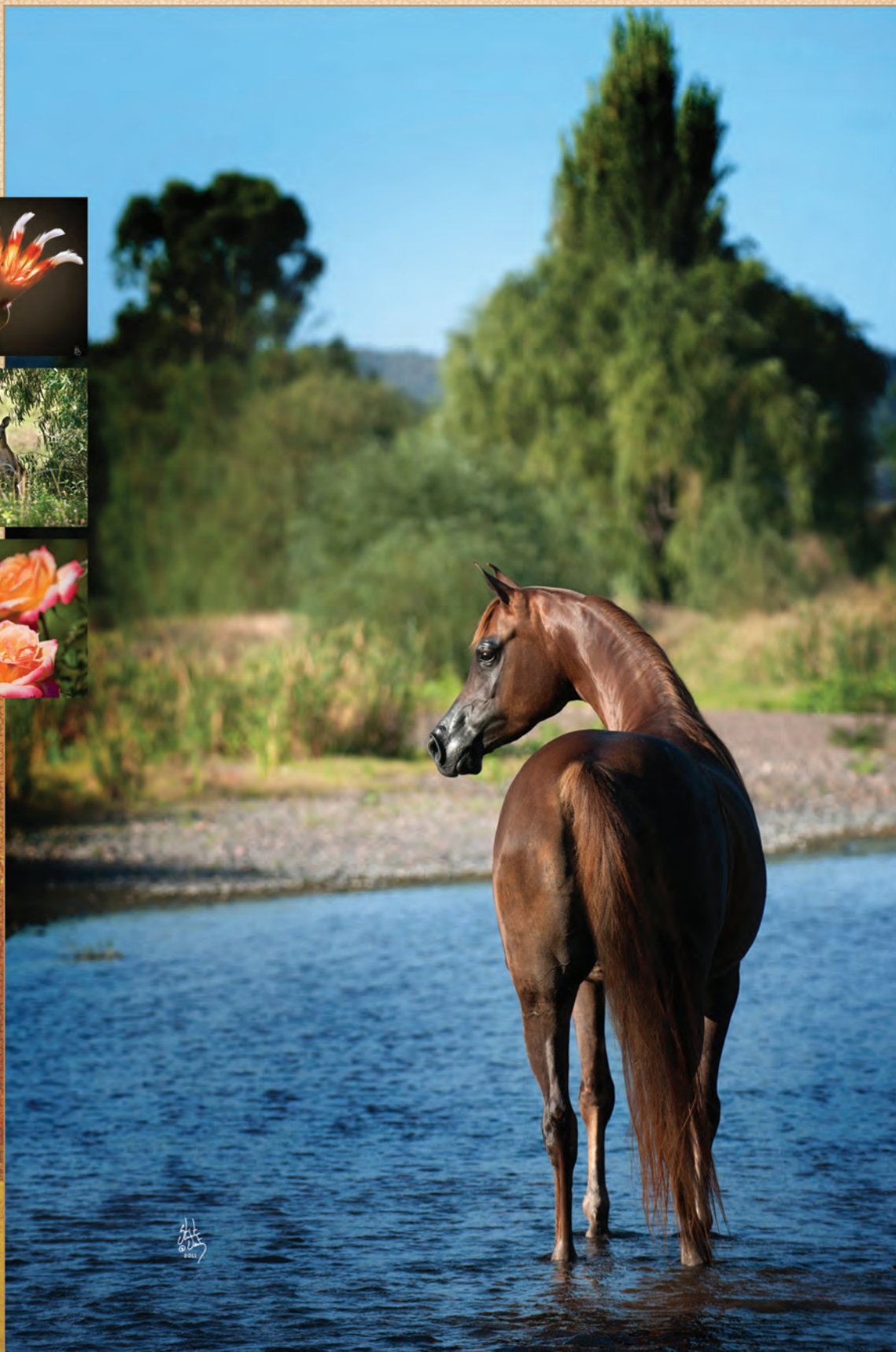
Twice Australian National Champion MULAWA KARISMAA (Magnum Psyche x Karmaa by Kaborr) in the Pages River at Alabama