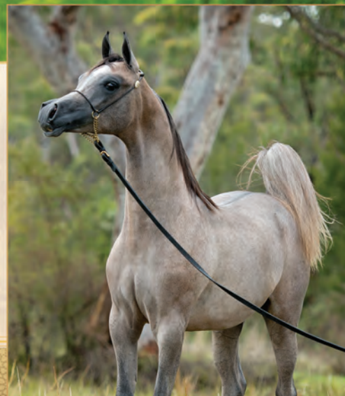
Top: National Stud Show Champion ALLEGIANCE MI (Magnum Forty Four x Audacia by Parkview Audacious) Mulawa Chief Sire Bottom left to right: Victorian Classic Champion BEYONCE MI (x LLC Briana by Pyro Thyme SA), MI MARIE (x Mae Marie by TS Al Malik) and National Stud Show and East Coast Champion ADVANTAGE MI (x Valentine MI by DA Valentino)