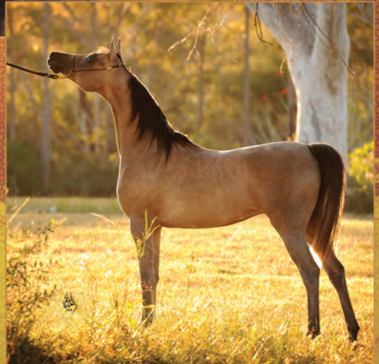
Top: Australian National Champion GUILIANO (Legacy of Fame x SC Psavannah by Padrons Psyche) Mulawa Chief Sire | Imported USA Bottom left to right: Australian National Champion MI HARMONY (x Fames Harmony by Fame Maker R), National Stud Show Champion KONQUEST MI (x Mulawa Karismaa by Magnum Psyche) and East Coast Champion MI APHRODITE (x Audacia by Parkview Audacious)