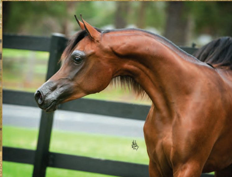
Top: Unanimous Australian National Champion KAVALLE MI (Gazal Al Shaqab x Karess by Magnum Forty Four) Bottom left to right: KARESS (Magnum Forty Four x Mulawa Kara Mia MI by GLF Apollo) with KLASSICAL FAITH MI (Klass) and GLAMOUR MI (Gazal Al Shaqab x Karess by Magnum Forty Four) Full Sister to KAVALLE MI