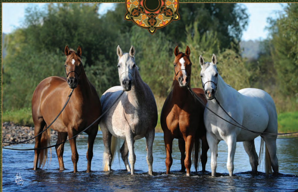
The Daughters of KARMAA in the Pages River at Alabama (left to right): MULAWA KARISMAA (Magnum Psyche), MULAWA ARIA (Arrival), MULAWA KARA MIA MI (GLF Apollo) and MAE MARIE (TS Al Malik)