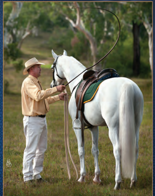
Three-Time Australian National Champion KLASS (TS Al Malik x Karmaa by Kaborr) Mulawa Chief Sire and Arabian Ambassador Extraordinaire