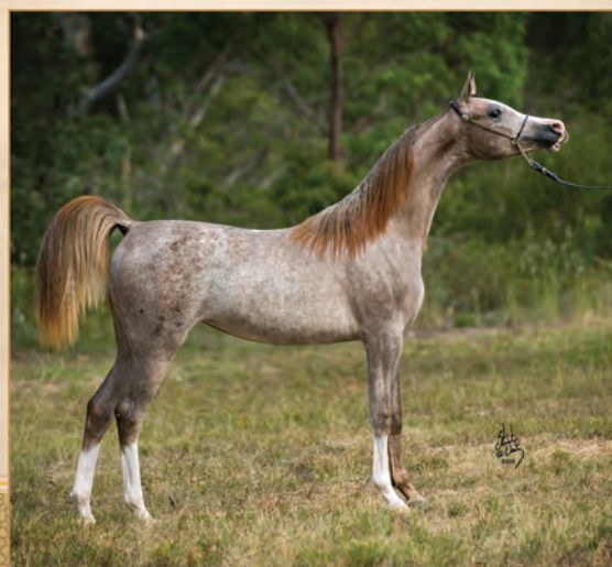
Top photos: National Stud Show Champion KLASSICAL DEVOTION MI (Klass x Mulawa Kiara by Magnum Psyche) Bottom photo: Australian National Reserve Champion KLASSIC HARMONY MI (Klass x Fames Harmony by Fame Maker R) Owned by Al Shagab Stud, Qatar