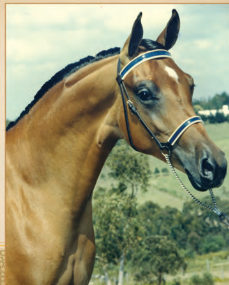
Left to right: EUNI (Bandos x Eunice by Comet) Mulawa Foundation Mare bred in Poland and imported from Germany, ARRIVAL (Ambition x Euni) Mulawa Chief Sire and MULAWA EUNIQUE (Ambition x Euni) Australian National Champion Mare