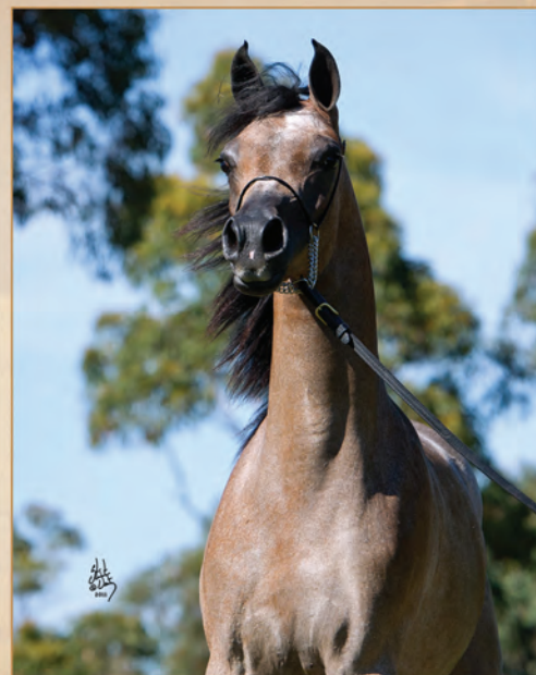
Pictured left to right: Australian National Champion & Aristocrat Dam of Six Champions MUSTANG'S MAGNUM (Magnum Forty Four x Sahtarah by Sahjat) with her East Coast Champion daughter MI KLASSIC FANTASY (Klass)