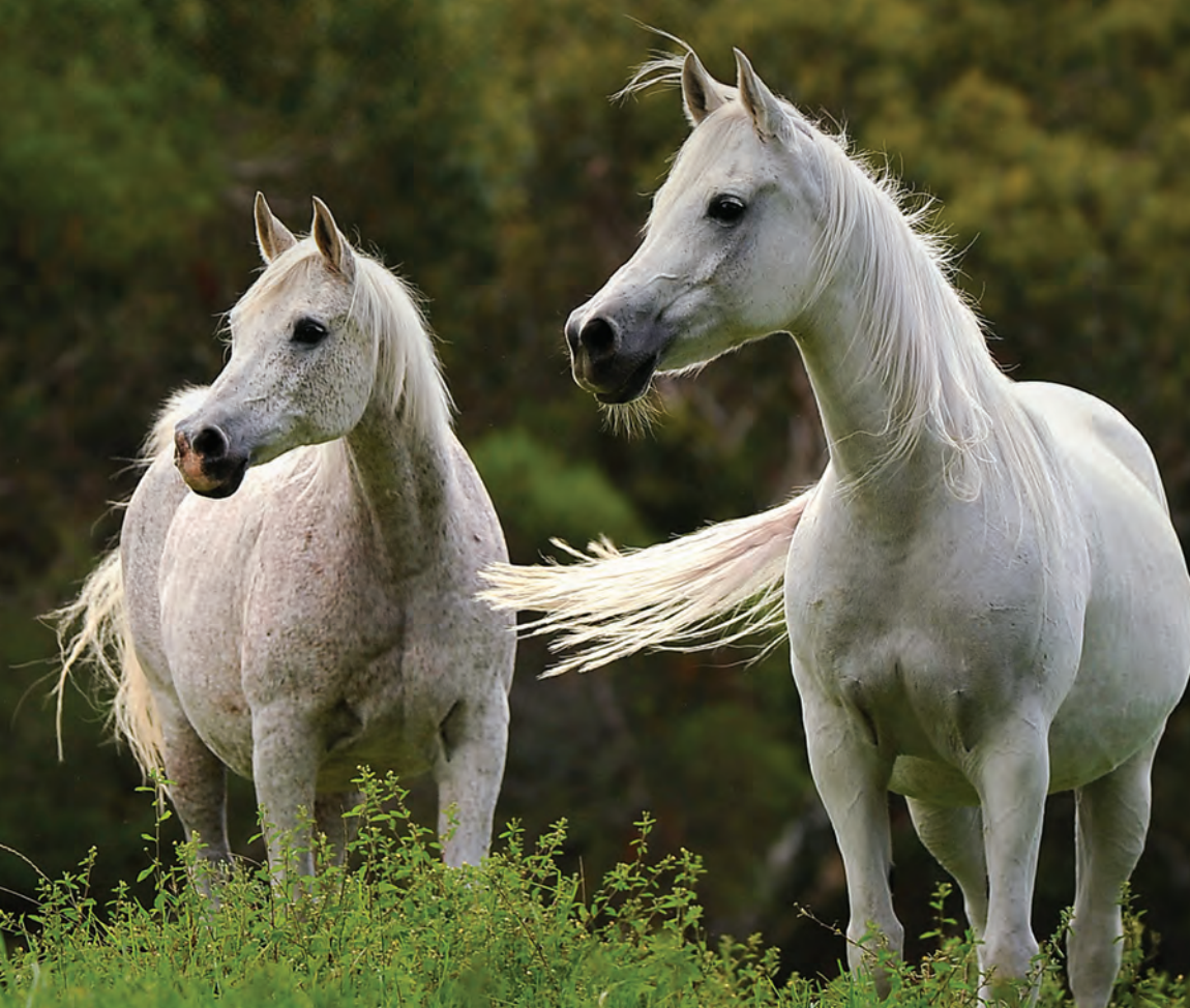
Pictured left to right: East Coast Champion KARMAA (Kaborr x AN Marieta by AN Malik), National Stud Show Champion MULAWA CHANCE (Ambition x Grojeca by Grojec) & Australian National Champion MULAWA BEHOLD (GLF Apollo x Amurath Beguile by Ramses Fayek)