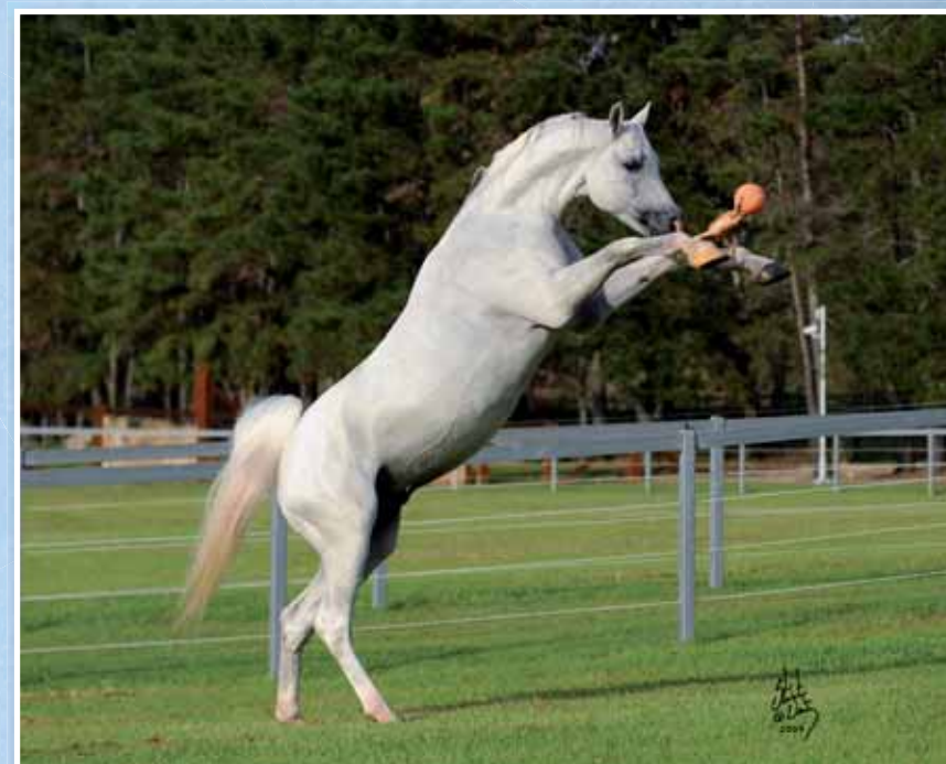
Australian & National Stud Show Champion Stallion Brazilian National Junior Champion Colt Scottsdale Reserve Champion Stallion

(Hello Barich x BF Tiffany Select by BF Rageymazon)