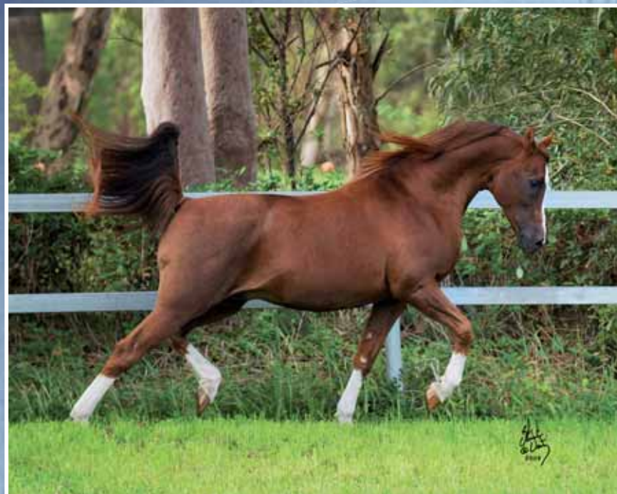
Australian Champion Stallion US & Canadian National Champion Futurity Stallion

(Fame VF x Inschallah El Shaklan by El Shaklan)