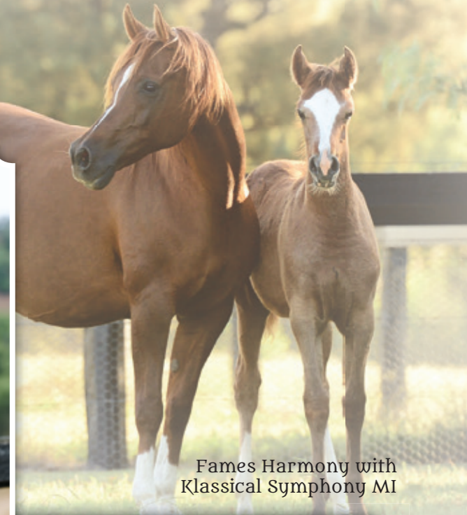
Fames Harmony with Klassical Symphony MI

(by Imperial Journal), and Victorian State Champion Princess Of Passion FF (by Crave FF). Princess of Passion has since extended the Mulawa Chance legacy to the fourth generation with her two champion daughters: Shimmering Princess FF (by SF Sir Real) and Princession FF (by Obsession FF).