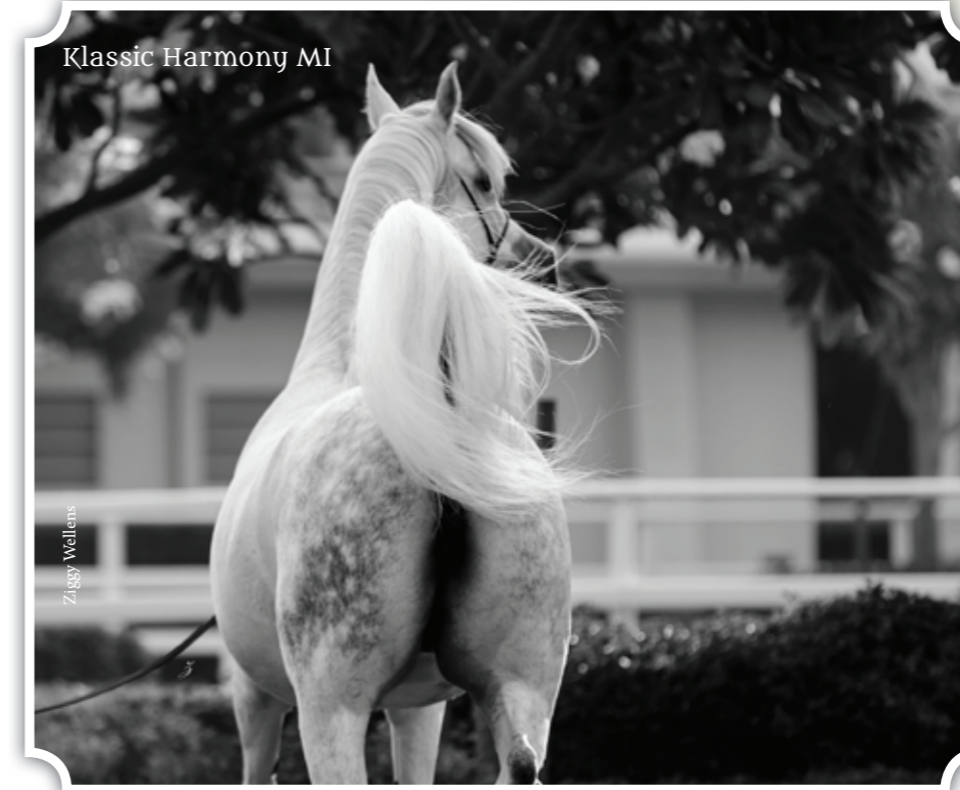
Klassic Harmony MI

On 17 of November, Mulawa Chance will celebrate her 33rd birthday. Having faithfully and most capably fulfilled the roles of show horse, broodmatron, breed ambassador and nanny to several crops of yearling fillies, Mulawa Chance has been an essential element of the heart and soul of Mulawa for more than three of the farm's four decades of existence. Most fittingly, she is the last remaining daughter of Ambition, still held in highest esteem as Mulawa's 'reason for being', the final living link to foundations upon which of all the programme's present-day success is firmly built. She is, to the delight of all, still thriving with extraordinary ease at Alabama, home to Mulawa breeding operation in the Upper Hunter Valley of New South Wales. Here, she is very much the grande dame in residence, looking less like a