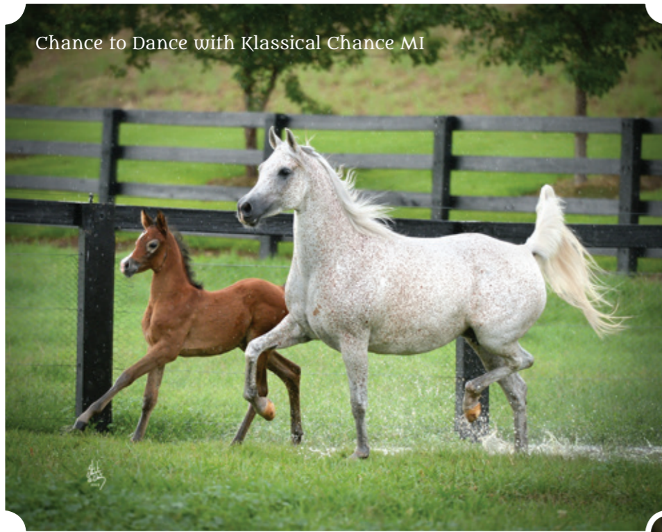
Chance to Dance with Klassical Chance MI

At 22 years of age, Mulawa Chance delivered the final edition of her direct legacy in the Southern Hemisphere spring of 2004 by Magnum Forty Four. In the same way the Mulawa Chance was a near carbon copy of her paternal granddam Bint Ambara (Comet x Ambara by Wielki Szlem) at birth, the ingeniously named Chance to Dance was every inch the spitting image of her beloved dam from the moment she arrived. Having grown more gloriously refined and arrestingly beautiful with age, Chance To Dance now bears the most striking resemblance to her dam in every respect,