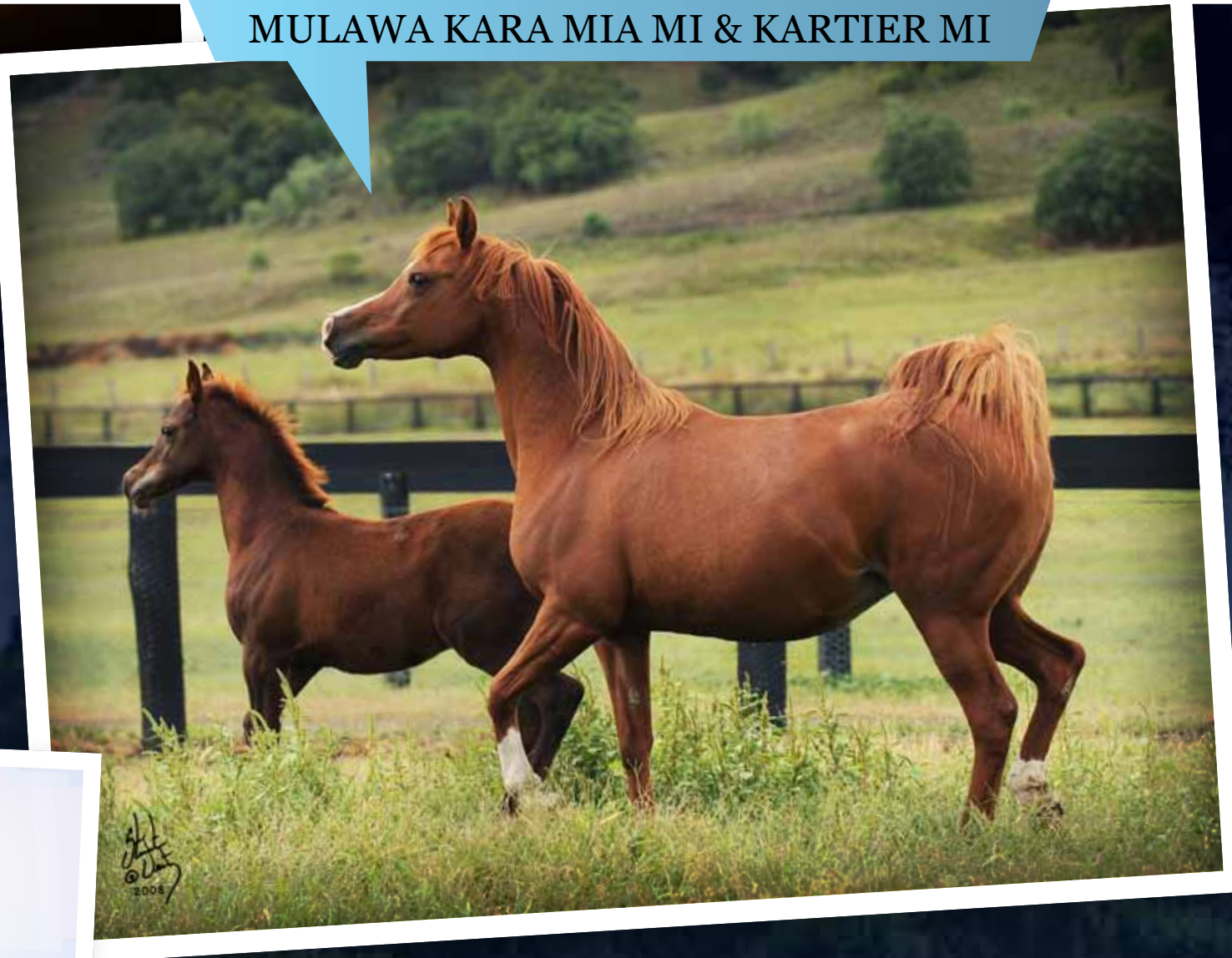
MULAWA KARA MIA MI & KARTIER MI