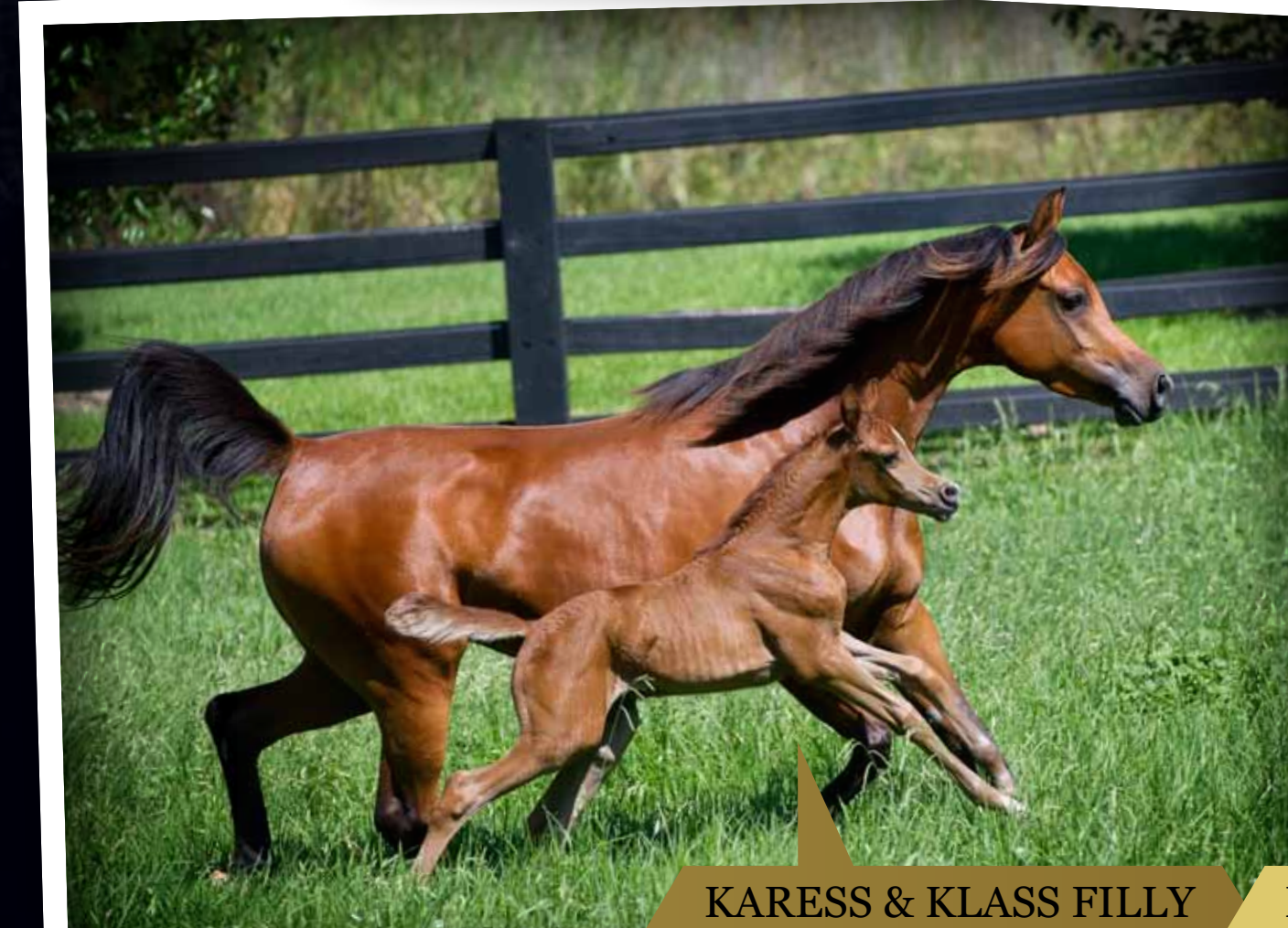
KARESS & KLASS FILLY