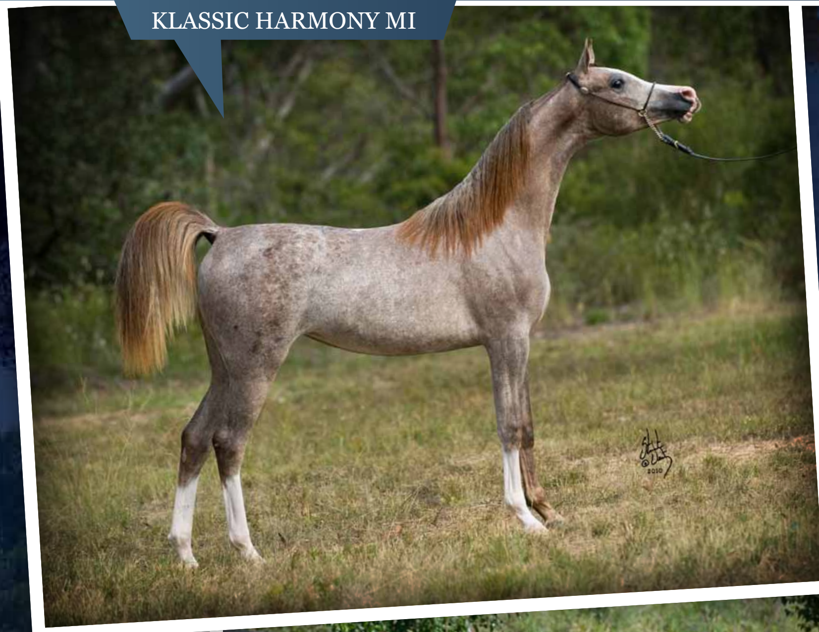
KLASSIC HARMONY MI

With KLASSIC HARMONY MI proudly carrying the banner for Mulawa in the Gulf, another six-generation Mulawa-bred filly has proven her worth on the opposite side of the world in the most elite show rings of North America. ALWAYS VALENTINE MI (x Always An Angel by SK Shakla Khan), the product of imported frozen semen from six-time US National Champion DA Valentino, spent 2011 competing amongst fillies almost twice her age as a September-born filly in the Northern Hemisphere. Despite this disadvantage, ALWAYS VALENTINE won the Junior Two Year Old Filly title at the world's largest Arabian horse show in Scottsdale, as well as the exceedingly prestigious Junior Reserve Filly Championship. These accolades were succeeded with Arabian Breeders World Cup honours as Reserve Champion Junior Two Year Old Filly & Top Ten Supreme Champion Junior Filly, the title of Region 13 Champion Two Year Old Filly, and the ultimate honour as United States Reserve National Champion Two Year Old Filly. Like KLASSIC HARMONY, ALWAYS VALENTINE is a member of a critically important Mulawa foun-