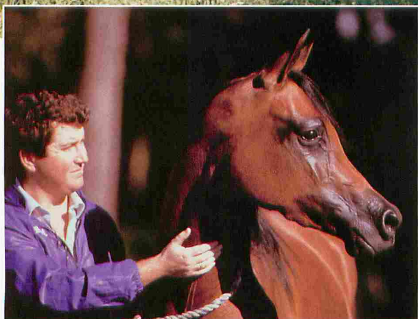
TOP: Vision (Jamil x Euni) Imp. U.K. ABOVE: Angelique (Vision x Abanda) RIGHT: Angelina (GLF Apollo x Angelique)

A charismatic and classically beautiful stallion, Vision has the finest skin quality of any horse Mulawa has seen throughout the world. With a coat the color of fire, Vision has become a sire of significance within Australia and, when used as an outcross in the Mulawa program, produces offspring with elegance, beauty, and type. His daughters are valued as among the best producers in Mulawa's mare band. Vision is the sire of the exciting 1996 Australian Champion Stallion Naavah, who stormed to an unanimous win under Australia's three judge system. Vision also sired East Coast Championships Champion Filly Perception (out of an *Aladdin daughter), a Reserve Australian Champion Mare, and many top tens. His granddaughter Angelica (Wanted KE x M Angelique, by Vision) also won the East Coast Championships filly title, while Presence (GLF Apollo x Prevue, by Vision) was the Reserve Champion Filly at the Sydney Nationals in November 1996. Presence went Reserve to another Mulawa filly, Kara Mia Mi (GLF Apollo x Karmaa).