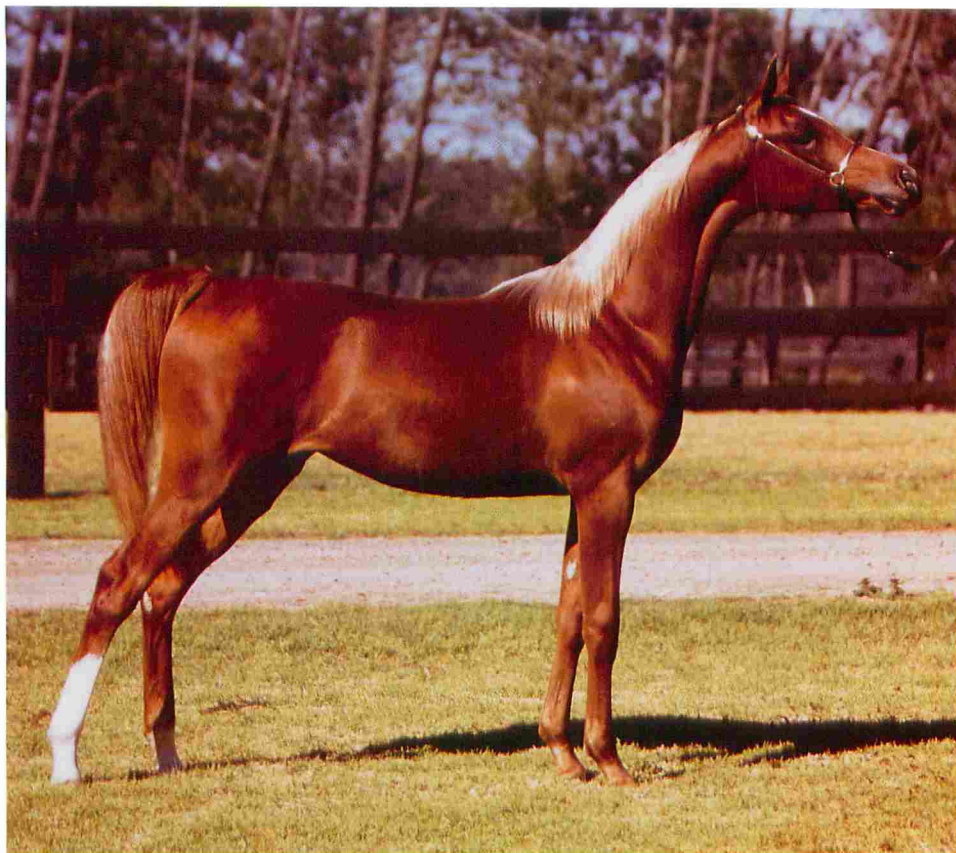
THIS PAGE: Presence (GLF Apollo x Prevue, by Vision) FACING PAGE: GLF Apollo (Diamond Padron x Per Brio, by Percussion)

Warranty's progeny have excelled in all avenues of the Australian show scene. His son, Wanted KE (Warranty x Feature, by Vision), was the Champion Stallion at the 1996 Sydney Nationals (defeating Fame Maker R for the only time in Australia). He is also a past Queensland Challenge Championships Champion Stallion, while Extended Warranty (Warranty x Enchante, by Ambition) was a Sydney Nationals Junior Champion Exhibit.