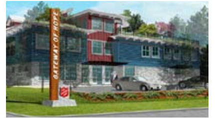
Gateway of Hope

All items can be new or used (if they are clean and in good condition) and can be dropped off on Sundays at JRCC until Dec 20.