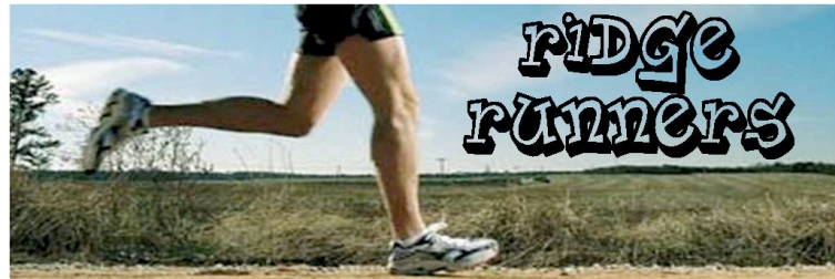
Meet us at the Jericho Starbucks for a run on Monday at 7 PM and Saturday at 8 AM.

This year, our wheelchair goal is 80. We've already raised more than $1000 towards wheelchairs (our kids have been donating their coins to the wheelchair fund and they've almost purchased their second chair!). Plus, each missions team member will be providing one wheelchair. This means that we only have 52 wheelchairs to go! If you'd like to donate towards a wheelchair, please write "Guatemala Wheelchair" on your giving envelope. Each chair costs approximately $75.