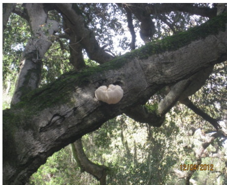
Lion's Mane Mushroom AKA “ Hericium erinaceus ”

...it will not matter what my bank account was, the sort of house I lived in, or the kind of car I drove... ... but the world may be different because I was important in the life of a CHILD—Anonymous