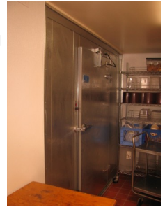
The New Walk-In Freezer