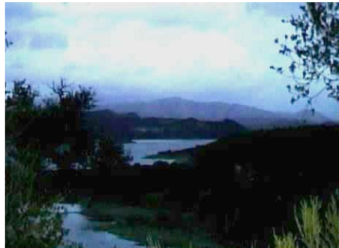
Discovering this idyllic place, we find ourselves filled with a yearning to linger here, where time stands still and beauty overwhelms.

Our Challenge Course offers experiential training and development that promote team performance, staff development & personal growth. Experienced based training along with a beautiful location will assure your retreat or conference a complete success.