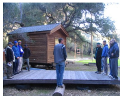
The "Whale Watch" is a great activity for any team!

Our 'low challenge course' boasts many possible options including a whale watch, TP shuffle, bricks and beams, team wall, low Tyrolean traverse, Mohawks walk, Nitro Swing, Spiders Web, Team