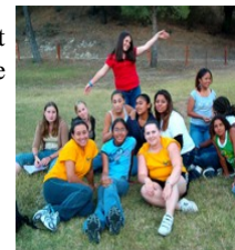
Camp Whittier puts smiles on faces and brings people closer

house 170 people and a spacious dining hall completes our facilities we can offer you.