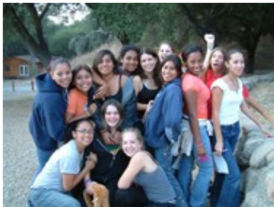
You too can discover the power of yourself and your team!

Camp Whittier offers educators and facilitators with specialized training to fit your needs. Whether you are caring for 175 at-risk youth, or a fortune 500 company that needs to bring their team closer, we can help you! At Camp Whittier, we have many tools and staff to help you design, develop and lead the experience of a lifetime.