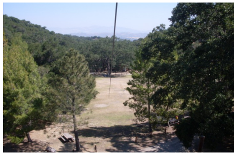
The view from atop our Zip Line. Magnificent!

With 13 individual challenges, a zip line and a 3 sides rock climbing tower you can keep participants busy working together for days.