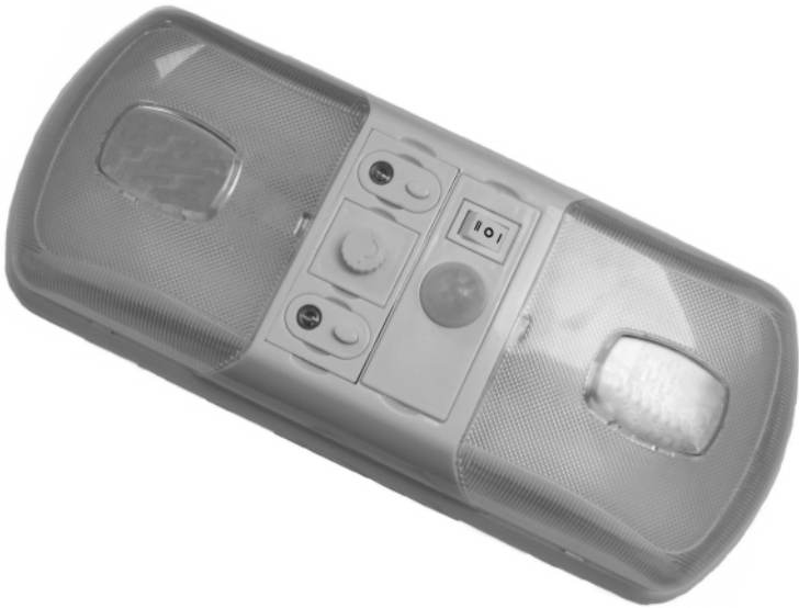
Brilliant Light 3000™ series showing all function modules installed properly.