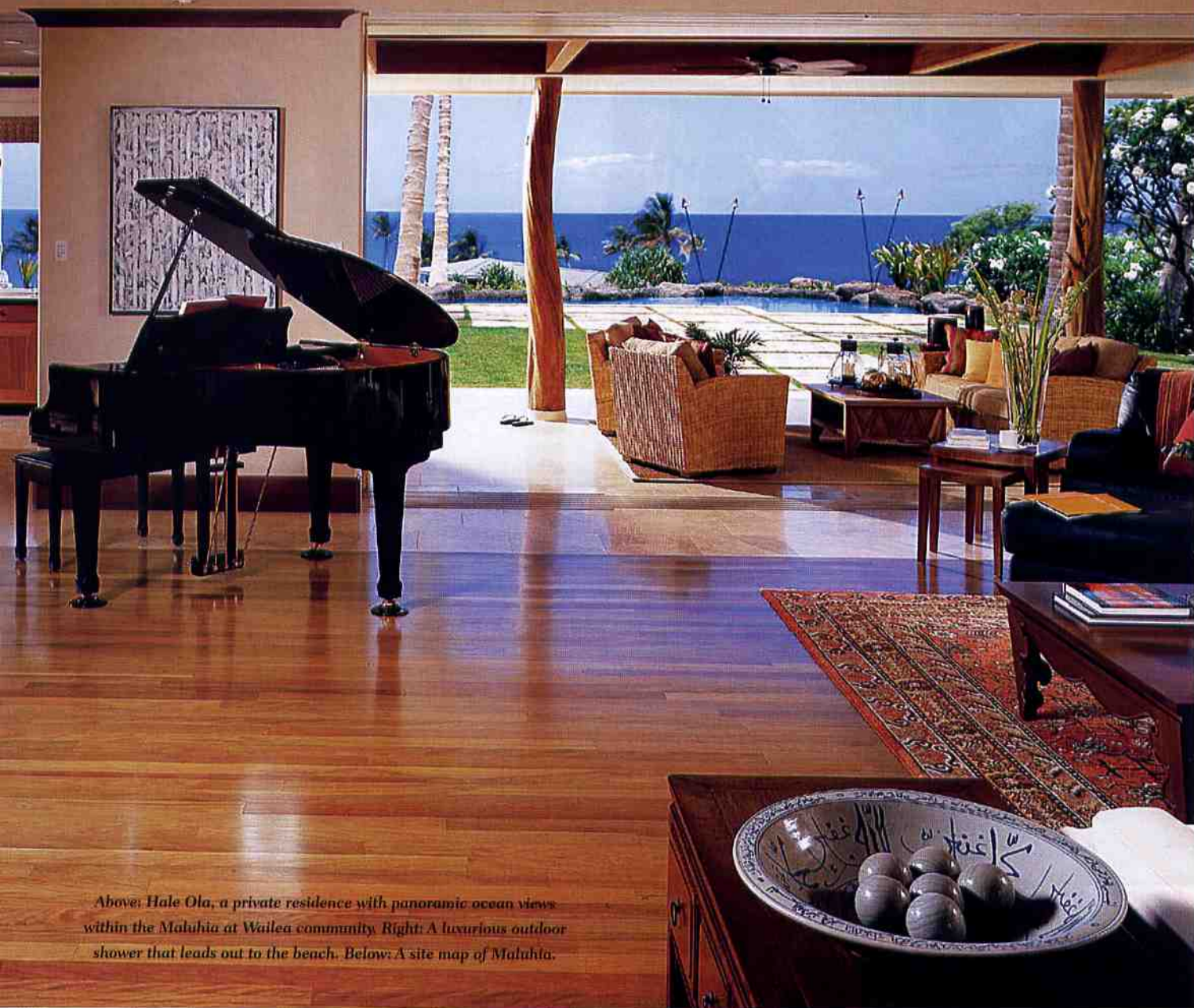
Above: Hale Ola, a private residence with panoramic ocean views within the Maluhia at Wailea community. Right: A luxurious outdoor shower that leads out to the beach. Below: A site map of Maluhia.