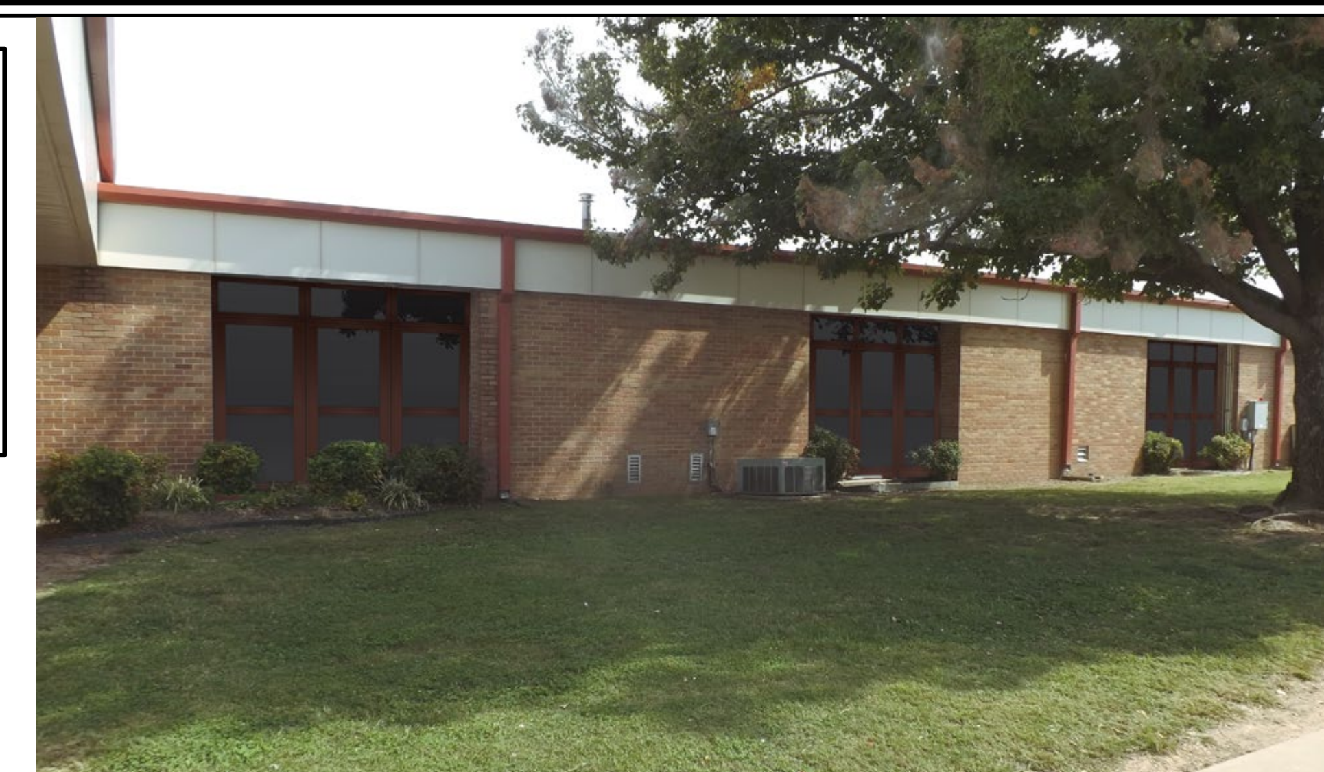
MIDDLE SCHOOL WINDOW REPLACEMENT