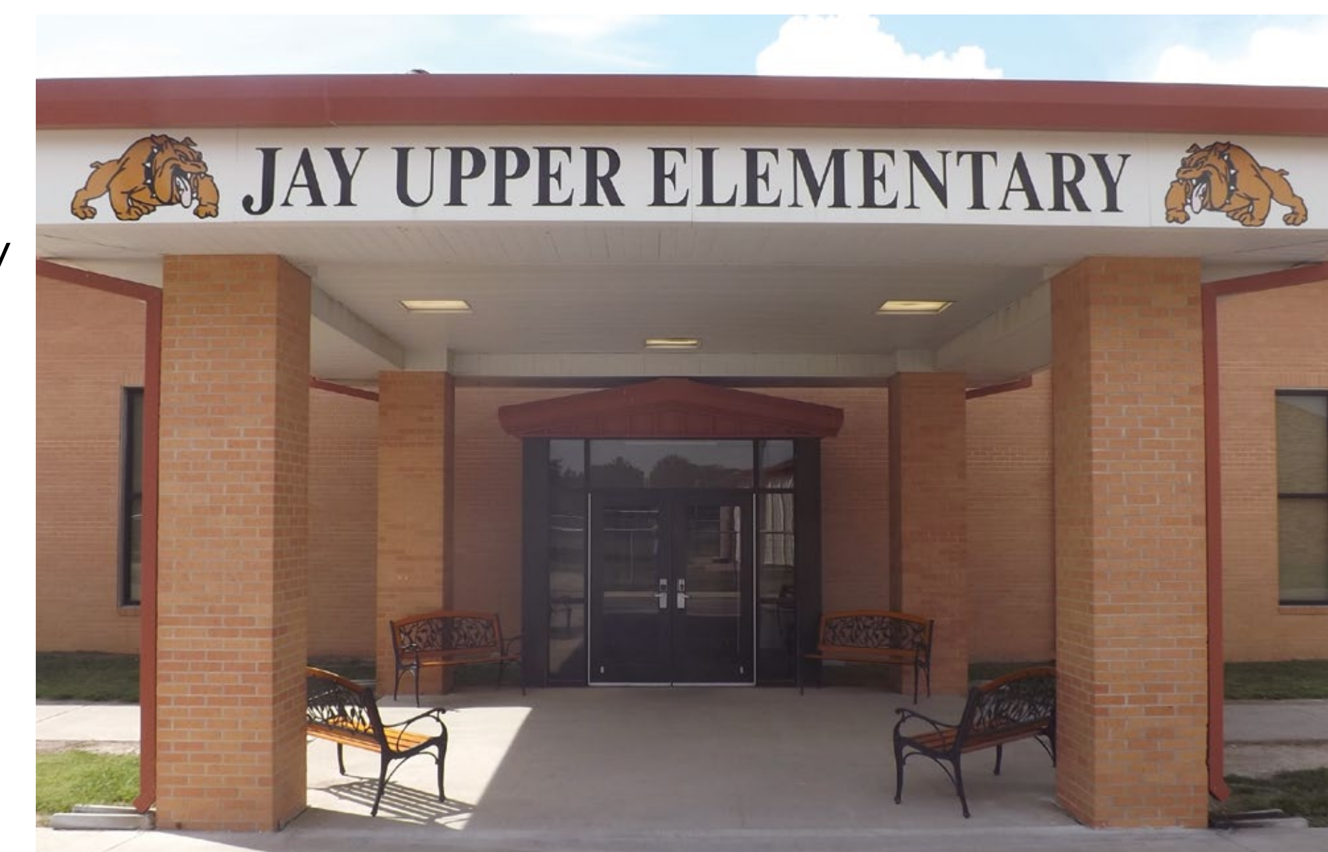
SECURE ENTRANCES: UPPER ELEMENTARY, MIDDLE SCHOOL & HIGH SCHOOL