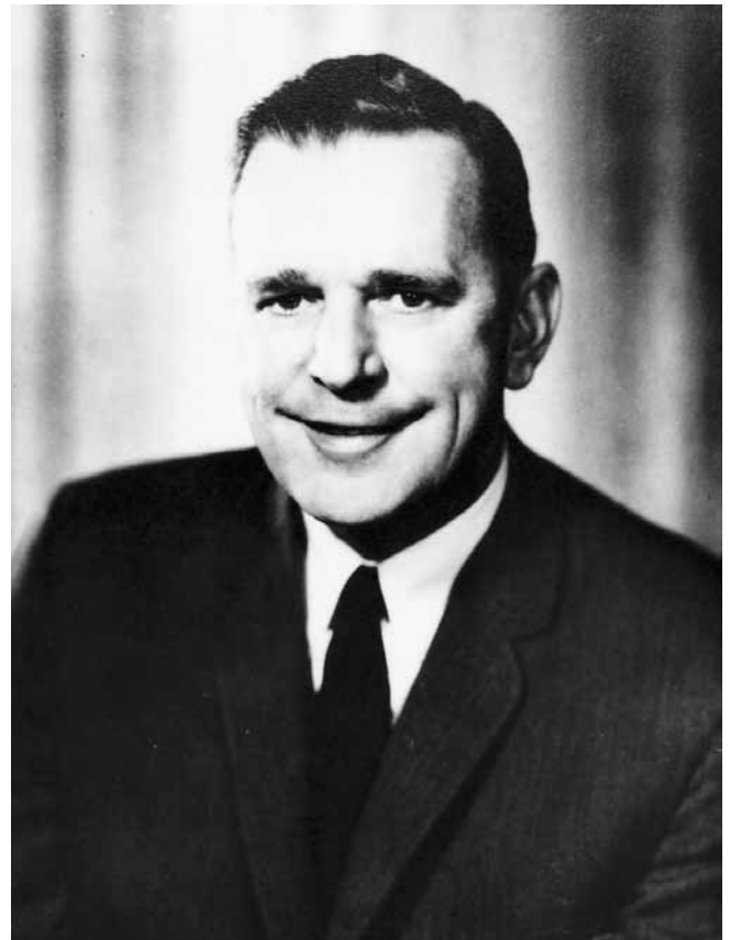
Governor Dewey Bartlett

Many campus protests were occurring around the nation because of the American involvement in Vietnam. Fearing such disorder on Oklahoma campuses, the state legislature and the governor passed a “speaker