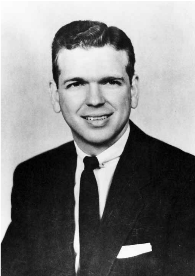
Governor George Nigh

On January 14, 1963, when Bellmon was inaugurated, he was younger than all but one previous Oklahoma governor, J. Howard Edmondson. Despite the new state liquor laws, Bellmon announced that he had served no liquor in his home and none would be served in the governor's mansion — nor at the Inaugural Ball. He also affirmed that he would wear no