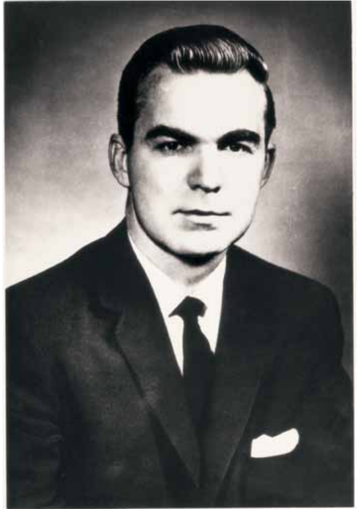
Governor J. Howard Edmondson

Perhaps for the first time since statehood, Oklahoma citizens knew what it meant to be " dry ." People who were accustomed to having access to liquor despite prohibition and who consequently had never seriously considered the matter, found that true prohibition was more than a little inconvenient . Many former "dries" began to regard the actual enforcement of prohibition as too expensive. With prohibition enforcement in the daily news, on television and radio, and constantly on the front pages