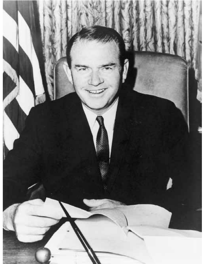
Governor Henry Bellmon

LARGEST CITY. On October 31, 1961, Oklahoma City became the largest city in the United States. On that date, the City Council annexed 42.7 square miles of land, making Oklahoma City the city with the larg-