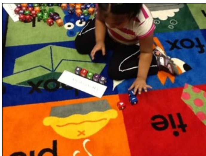
A pre-school student practices letter recognition through a matching activity using colored blocks and a letter chart.

The social-emotional, physical, cultural and aesthetic developmental needs of the children in the program are met by providing the children with exposure to a well-defined developmentally appropriate setting. Specifically, classroom centers meet the developmental needs of all children by encouraging students to differentiate between themselves and others, appropriate personal exchanges, and forming friendships. Centers are designed to meet the five developmental domains: fine motor, gross motor, sensory, dramatic play, and reading/literacy.