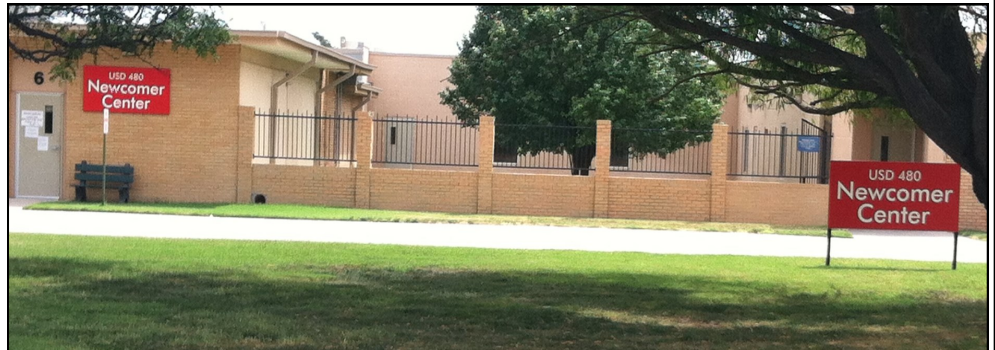
The USD 480 Newcomer Center is located next to Lincoln Elementary School at 1002 W. 11th St. (11th & Tulane)