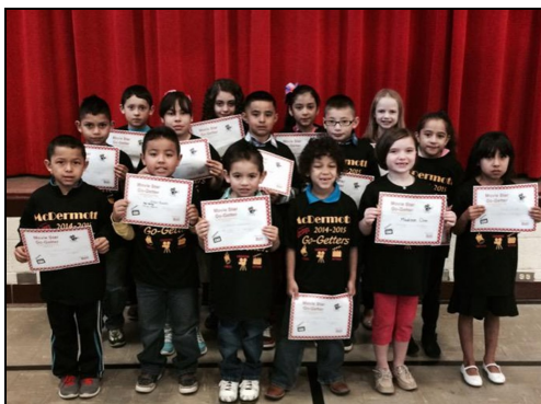
McDermott Elementary student Go Getters for the month of February were recognized for exhibiting the character trait of the month: caring.