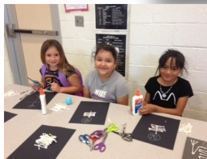
Students at McDermott Elementary participate in Lights On Afterschool activities as a part of Project SOAR