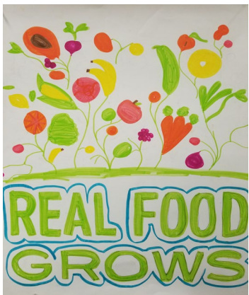
Myia Bunda 10 th grade