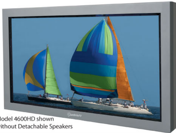
Model 4600HD shown without Detachable Speakers