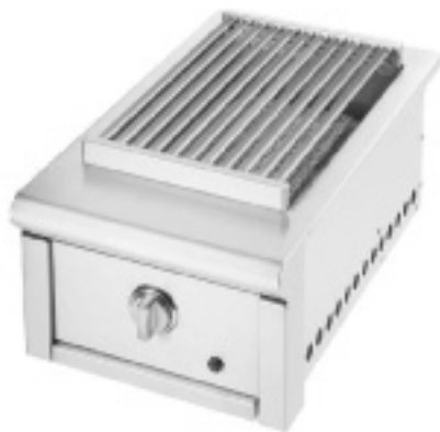
Product Shown: E15IRBI