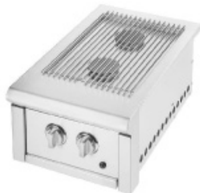
Product Shown: E15SBBI