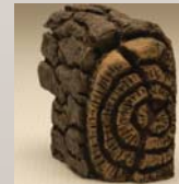
Fiber Ceramic Hi/Lo Valve Cover-VWFHLC