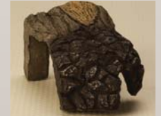
Fiber Ceramic Pilot Safety or Manual Valve Cover-VWFMVC