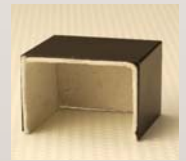
Metal Remote Receiver Cover-RRCM