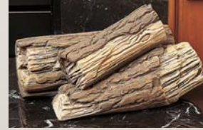
Fiber Ceramic Log Remote Receiver Cover-RRCL