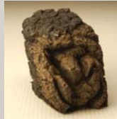
Fiber Ceramic Millivolt Valve Cover-VWFMVC