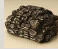
Fiber Ceramic Ember Remote Receiver Cover-RRCE