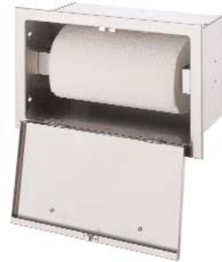
Product Shown: OCI-PTH